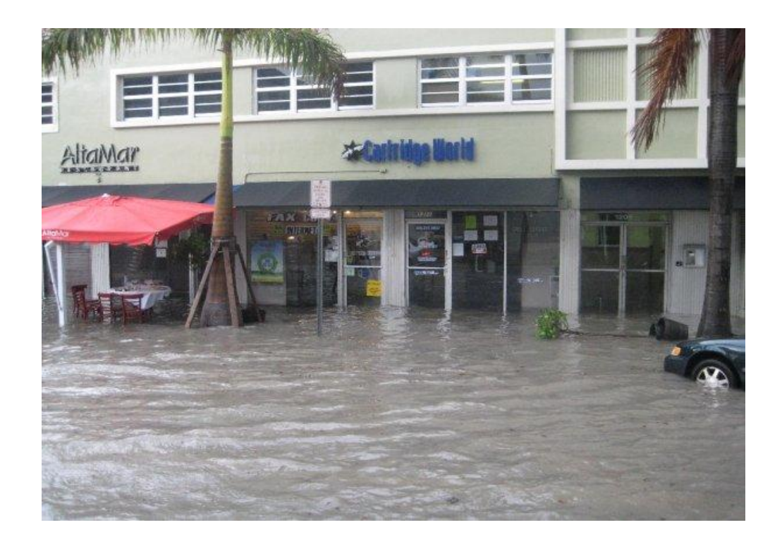
Figure 3: Severe flooding in Miami Beach on June 5<sup>th</sup>