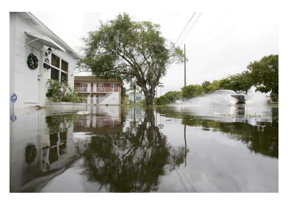
Figure 4: Severe flooding in Hallandale Beach from torrential rains of December 17/18