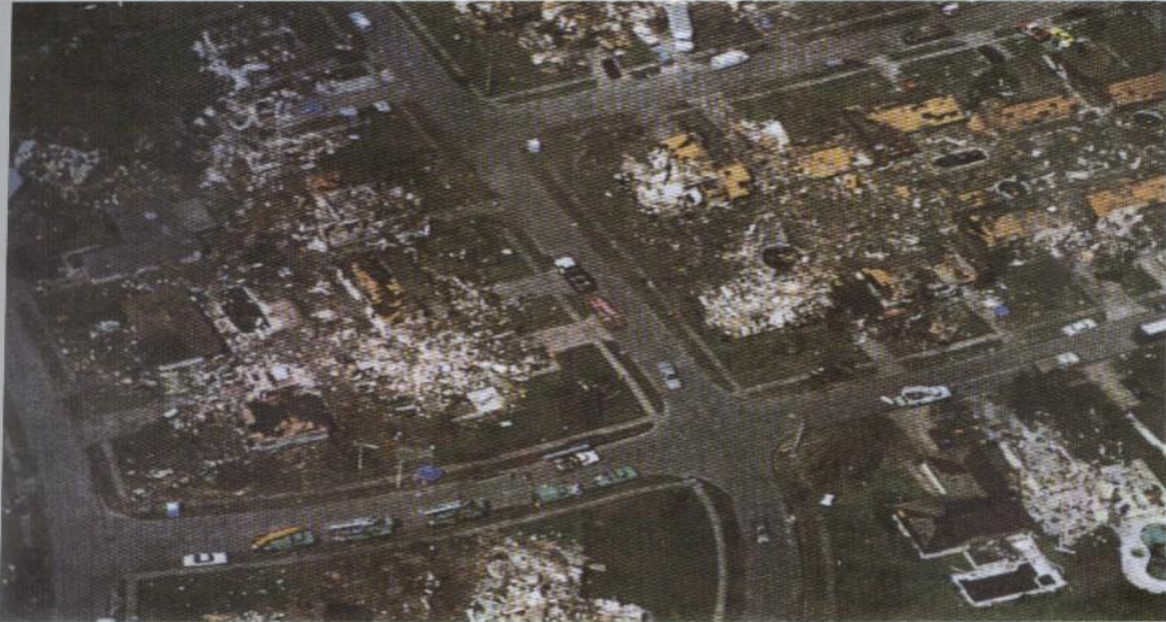
Figure 3. Strong F3 damage to the Beacon Hill subdivision. Construction of homes were either reinforced concrete block or wood frame.