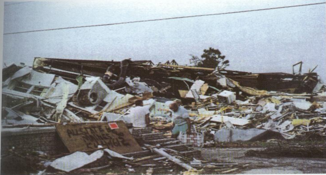
Figure 7. Remains of a mobile home in the Park Royale Village that became airborne and struck a home. One person that was in the mobile home was killed.