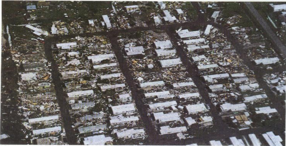
Figure 1. Damage to the Indian Rocks Mobile Home park from the Largo tornado.