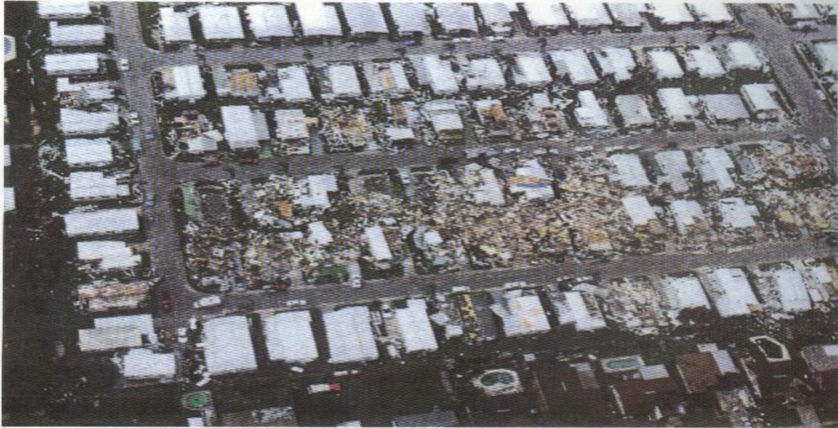
Figure 5. Aerial photo of damage to the Park Royale Village mobile home park from the Pinellas Park tornado. Notice the apparent skipping pattern indicating that the tornado may have become a multiple vortex storm.