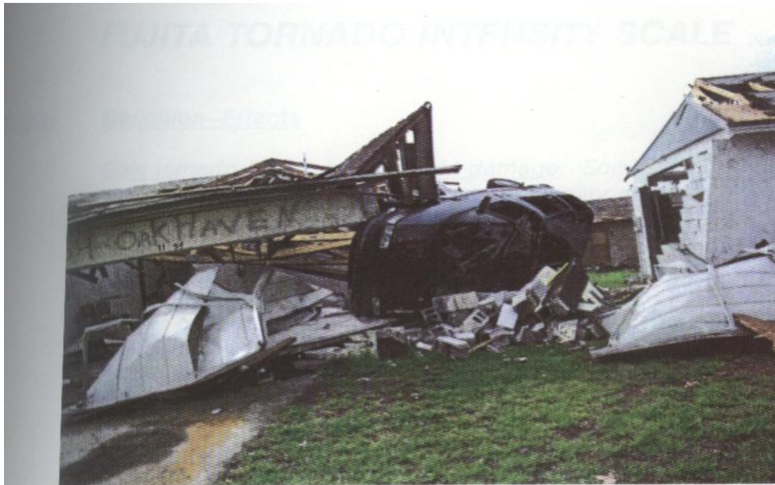
Figure 11. Minivan that became airborne and struck this home in the Beacon Hill subdivision in Pinellas Park.