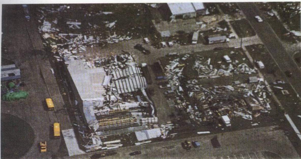
Figure 4. Warehouse buildings heavily damaged by the Pinellas Park tornado.