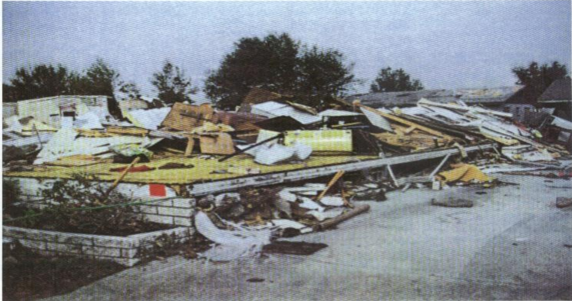
Figure 9. A mobile home in Park Royale Village that that was ripped apart. Note the frame and flooring of the mobile home is still tied down.