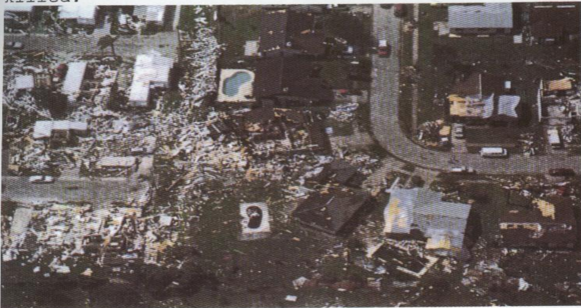
Figure 8. Aerial photo of the mobile home (above) that struck a home in a residential subdivision (center of photo). The mobile home moved from left to right.