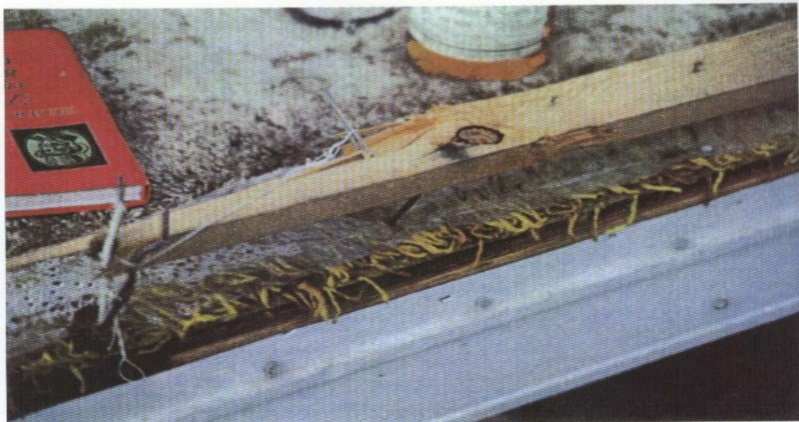
Figure 10. Close-up of the mobile home above indicating how the bottom plate was connected to the frame. Nails approximately 1 1/2 to 2 inches long held down the plate.