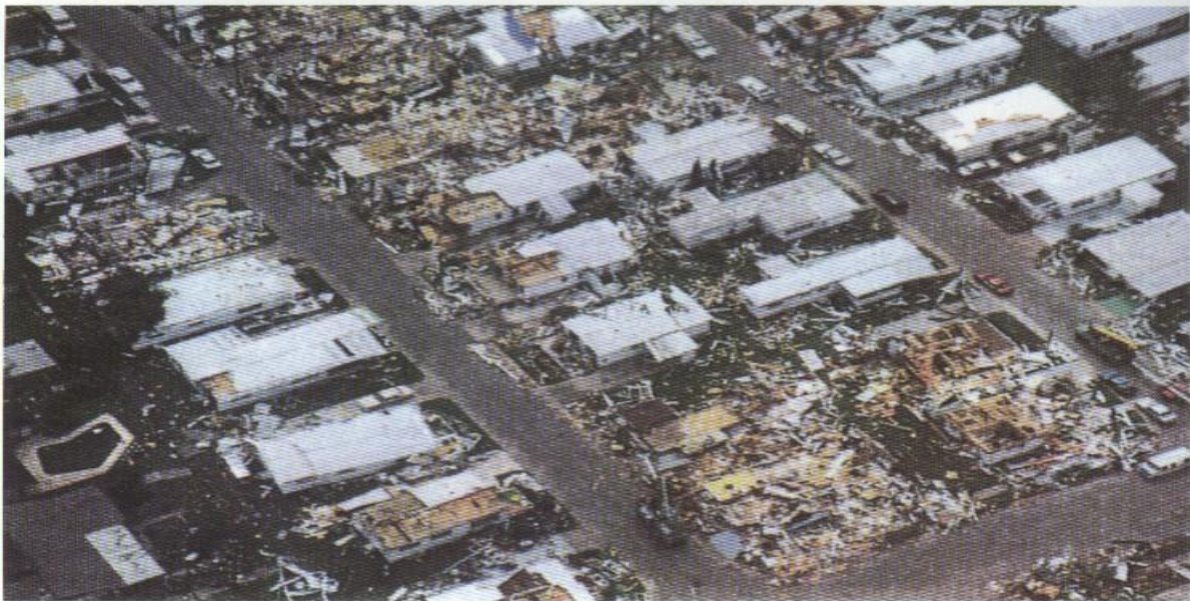
Figure 6. Close-up view of the Park Royale Village mobile home park. Many homes were totally destroyed.