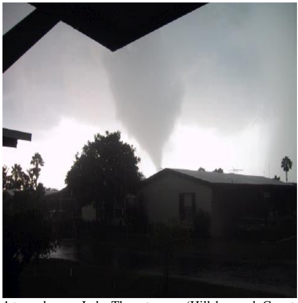
F-1 tornado near Lake Thonotosassa (Hillsborough County) during the evening of July 8th.

June 29th: Quick-hitting tornado strikes Dade City at Suppertime