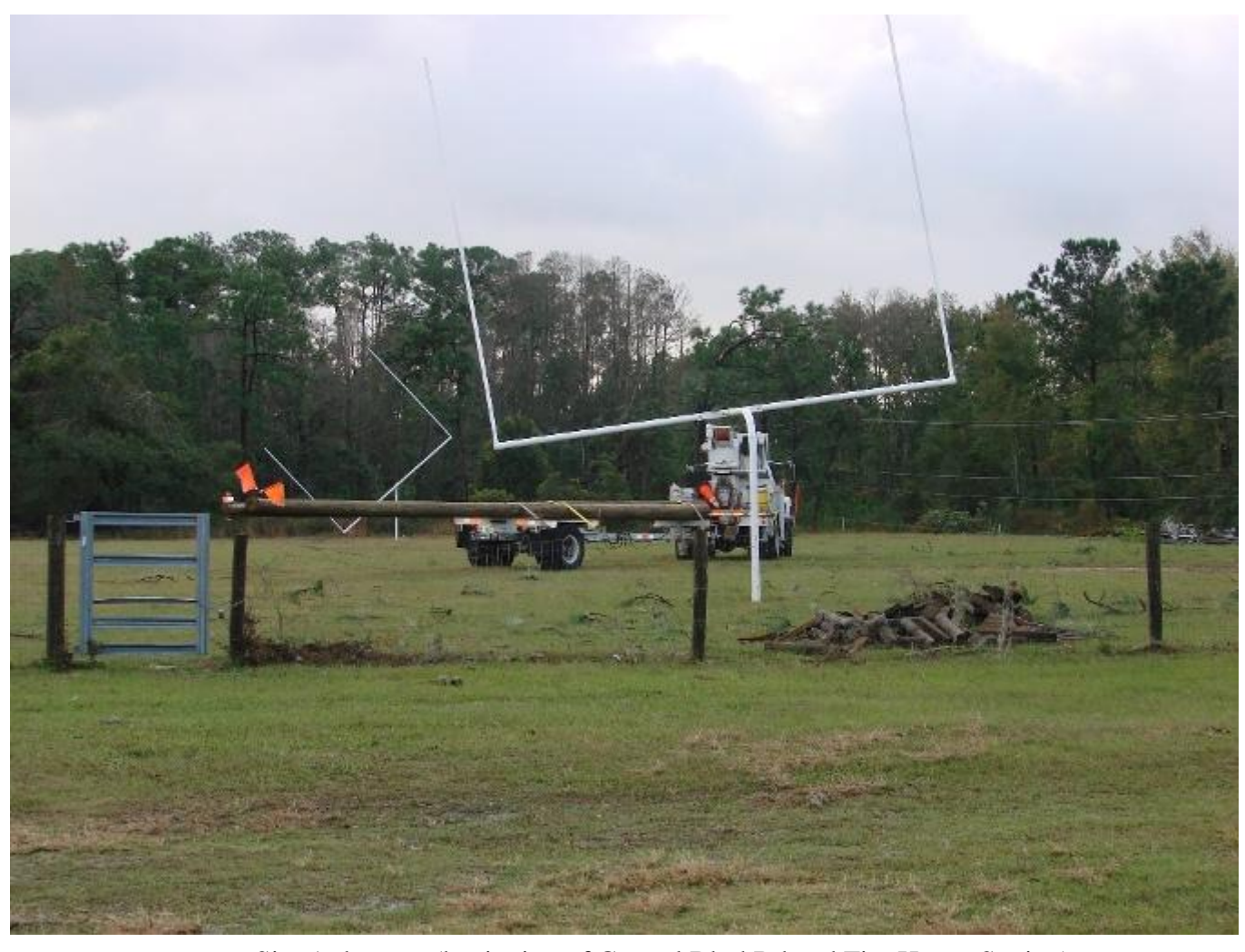
Figure 3. Site A damage (beginning of Central Blvd Rd and Fire House Station).