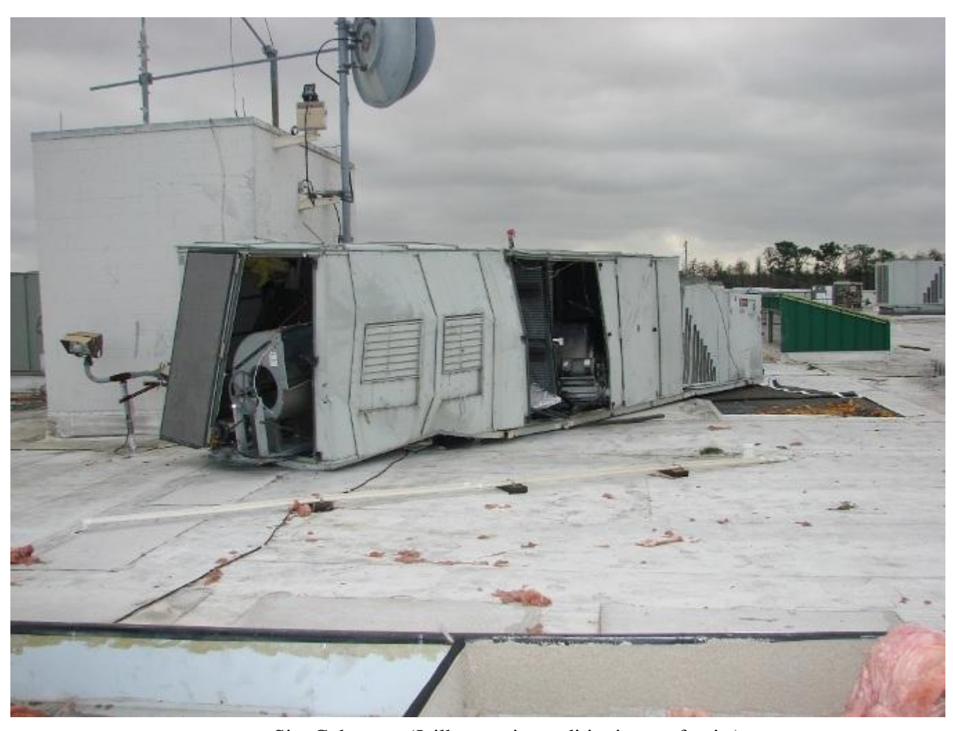
Figure 5. Site C damage (Jailhouse air conditioning roof units).