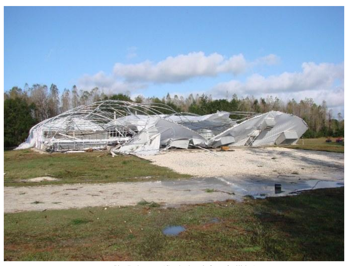
Figure 4. Site B damage (Gardening & farm facilities).