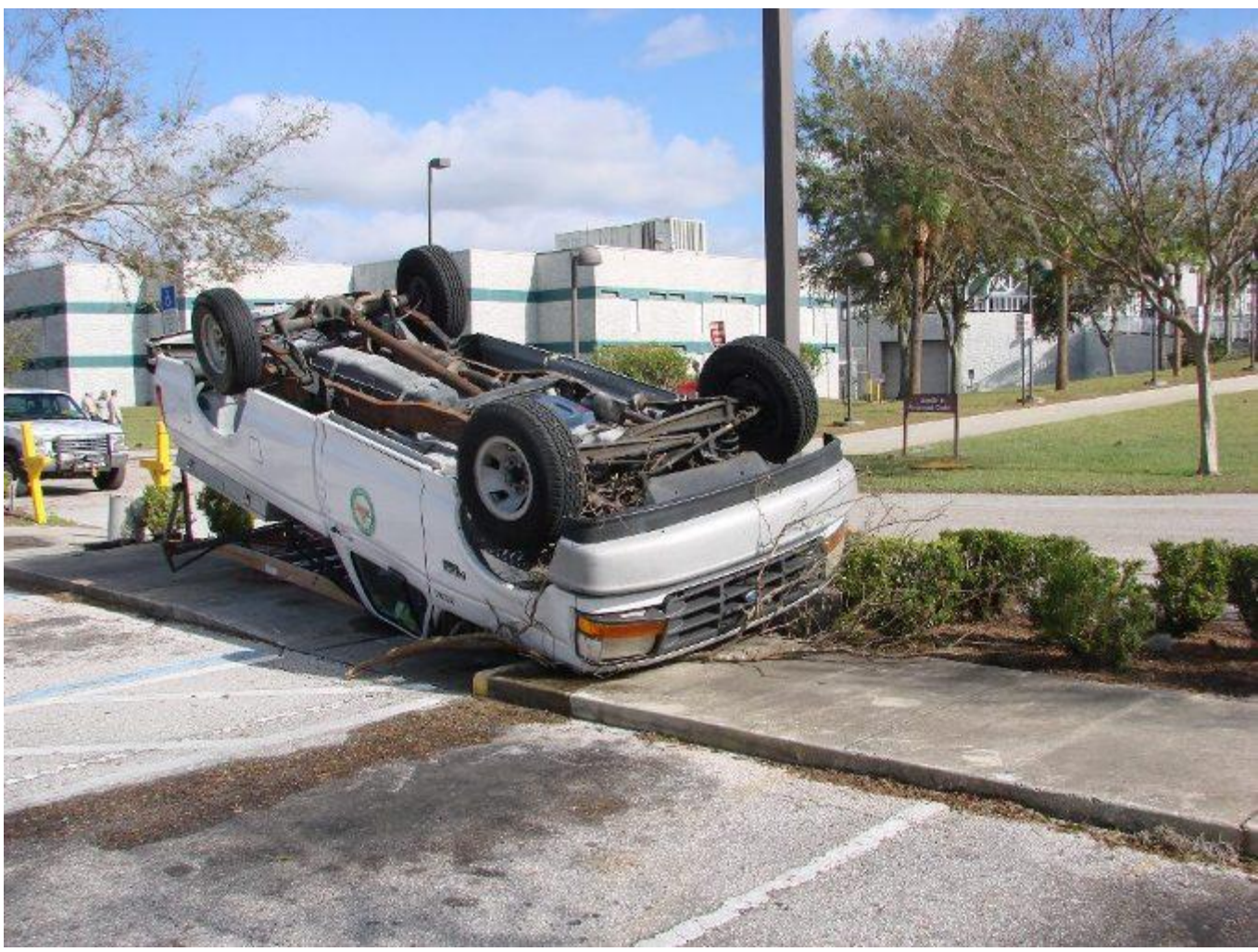
\label{eq:Figure 6.} \textbf{Site C damage (Jailhouse parking lot and rear field)}.