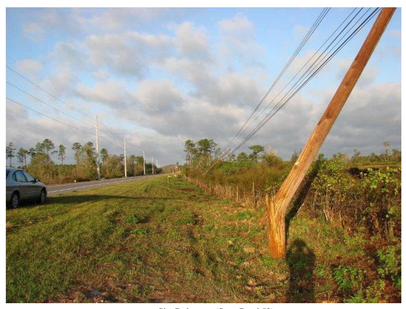
Figure 7. Site D damage (State Road 52).