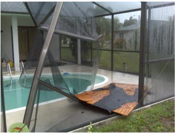
Roof sheathing from a nearby home was thrown into this pool cage.