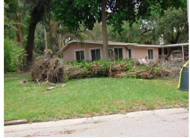
Uprooted tree that fell on a house on Grand Circle