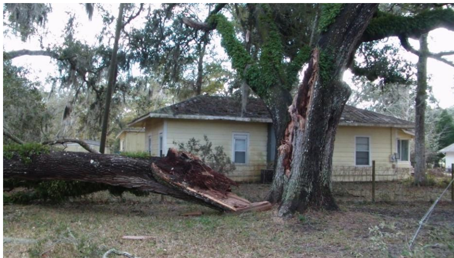
Fig. 7: Large tree broken in half on Ferry Avenue.