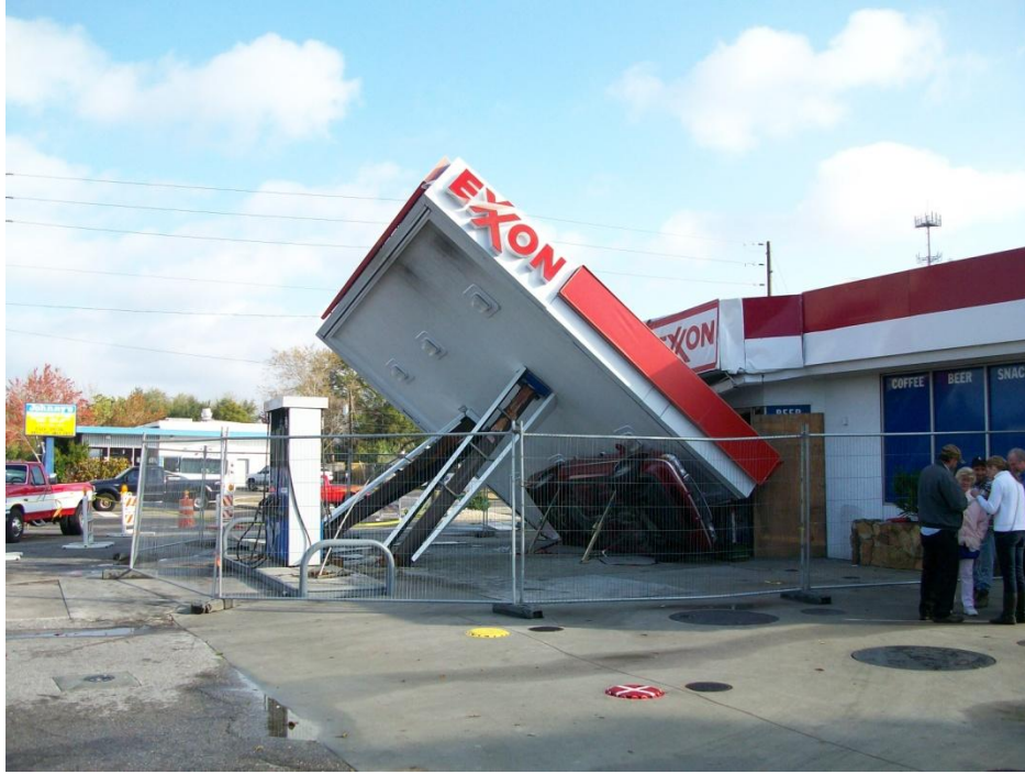
This is looking north at the gas station. The canopy is resting on the top of the car.