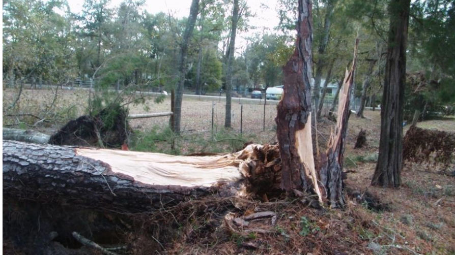
Fig. 8: Large tree downed by the strong winds on Ferry Avenue.