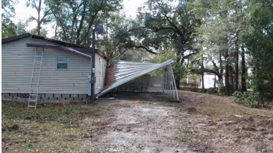
Fig. 10: Carport partially collapsed, gutters partially torn off on Ferry Ave.