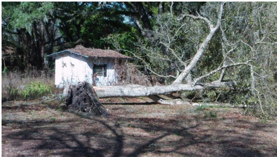
Fig. 9: Small tree uprooted on Ferry Avenue.