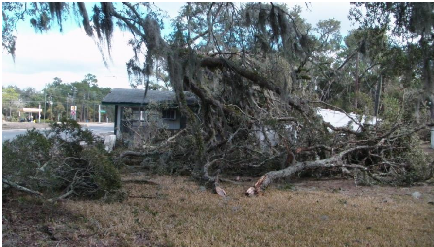
Fig. 11: Large tree branches torn off by the strong winds at US Highway 41 and Ferry Avenue.