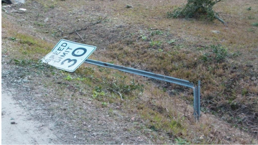
Fig. 12: Broken street sign on Ferry Avenue.