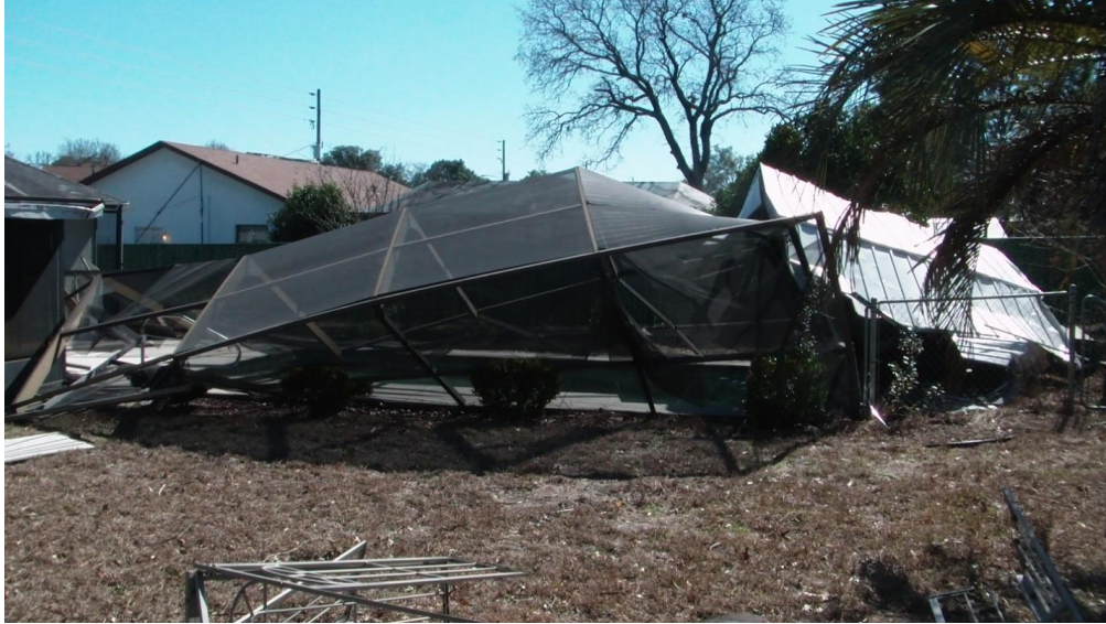
Fig. 4: Collapsed pool cage on Matthew Avenue in Spring Hill.