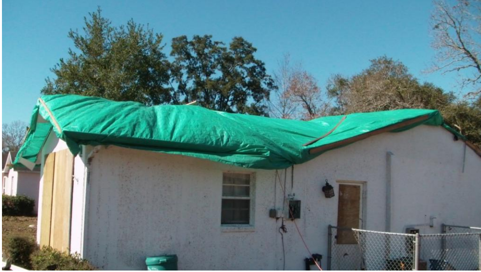
Fig. 2: House on Indigo Street in Spring Hill had significant roof damage due to the strong winds.