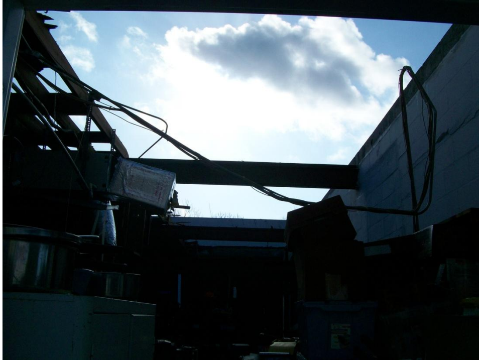
Roof that blew off western side of building.