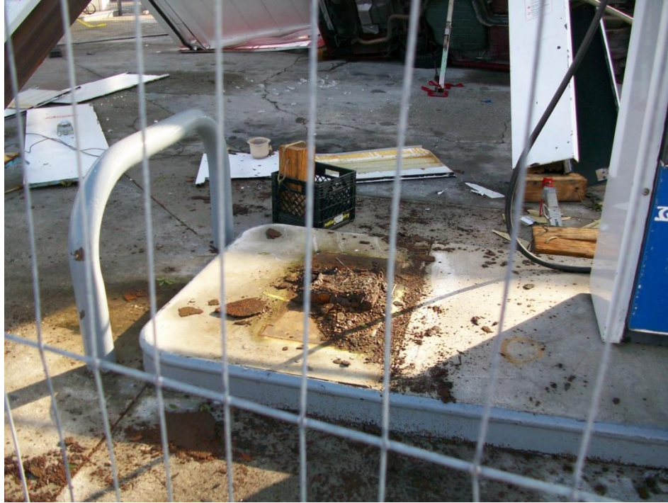
The bases of the canopy supports were rusted through.