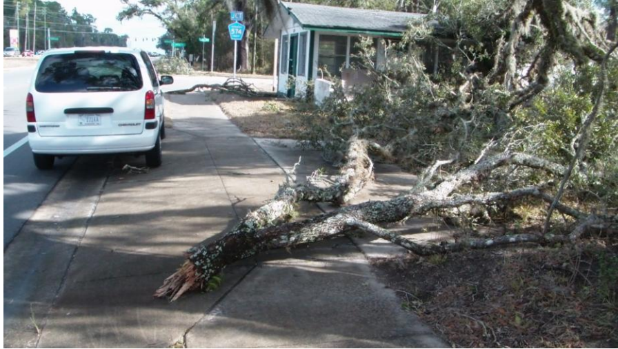
Fig. 6: Large broken branches at US Highway 41 and Ferry Avenue.