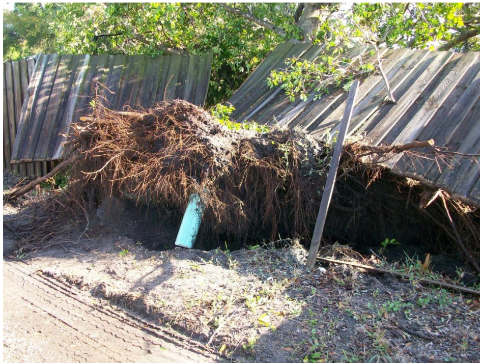
Tree uprooted across from roof damage along an alleyway. Did not do any damage to structures, but did uproot a sewer line.