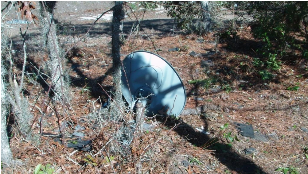
Fig. 3: Satellite dish, along with some aluminum gutters, resting on the ground on Indigo Street in Spring Hill.