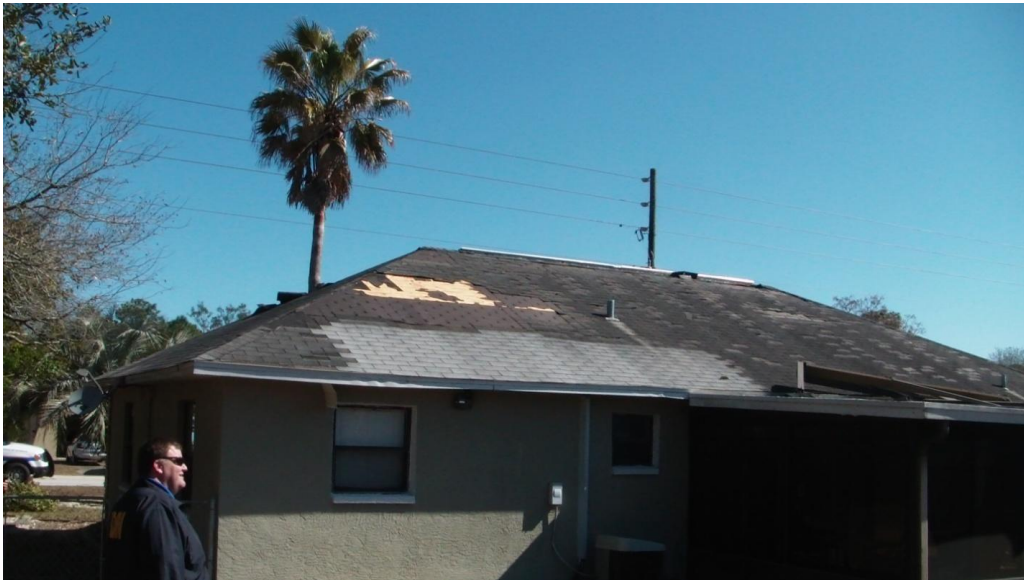
Fig. 5: Shingles missing on a house on Matthew Ave, Spring Hill.