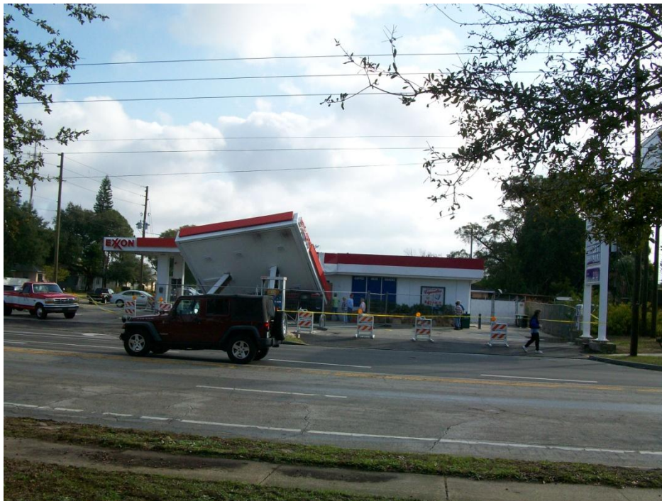
This is looking towards the east at the gas station.