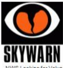
NWS Looking for Volunteers to Report Severe Weather