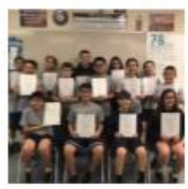
Weather Ready Nation Ambassador Expands Effort at School