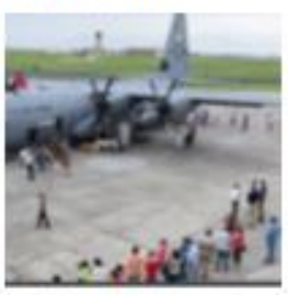
2018 Hurricane Awareness Tour in Lakeland