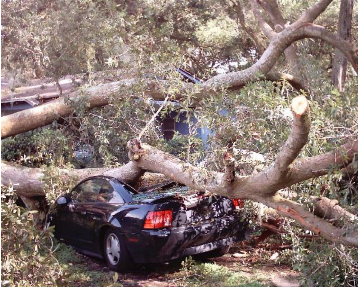
Figure 3. Photograph of damage from a fallen tree.