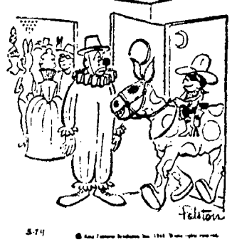
"We couldn't find a baby-