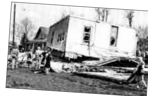
1948 Lonia tornado in Chickasaw Co.