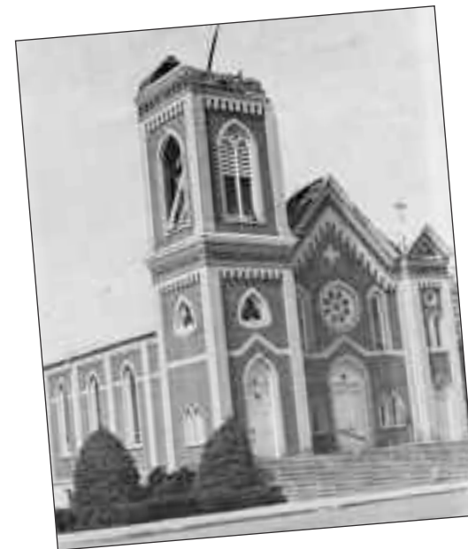
At left: Immaculate Conception Church