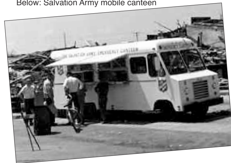
Below: Salvation Army mobile canteen