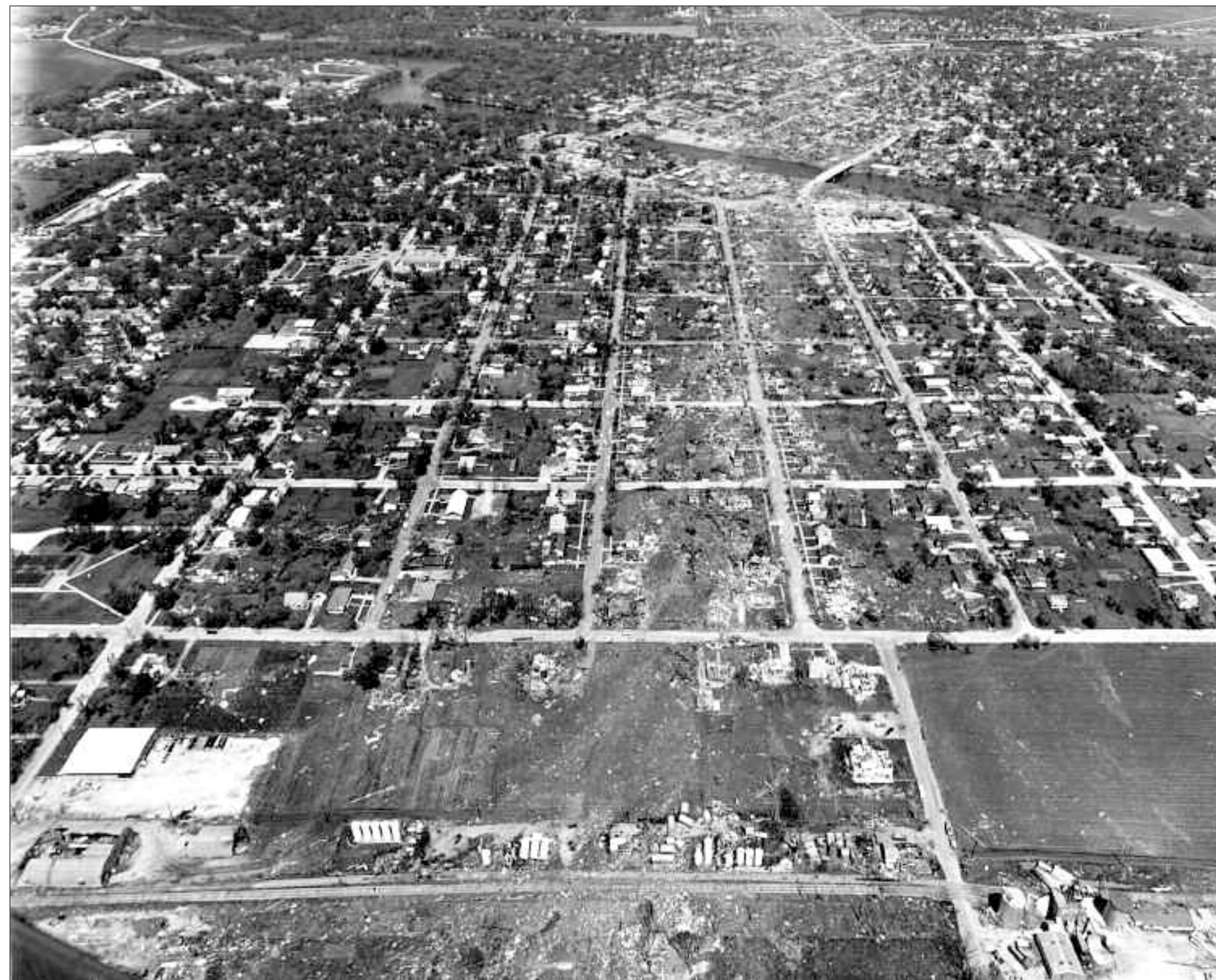
Tornado's path through Charles City on May 15, 1968. That's S. Main Street on the left, Hulin on the right and 9th Street running east-west.