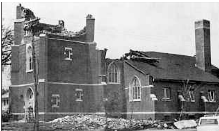
Damaged Congregational U.C.C. Church in 1968

Carr can be contacted at (319) 277-3679 or at: teresa.carr@cfu.net .