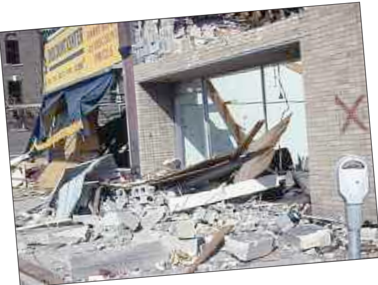
Above: Gibson Discount Center and Iowa Public Service