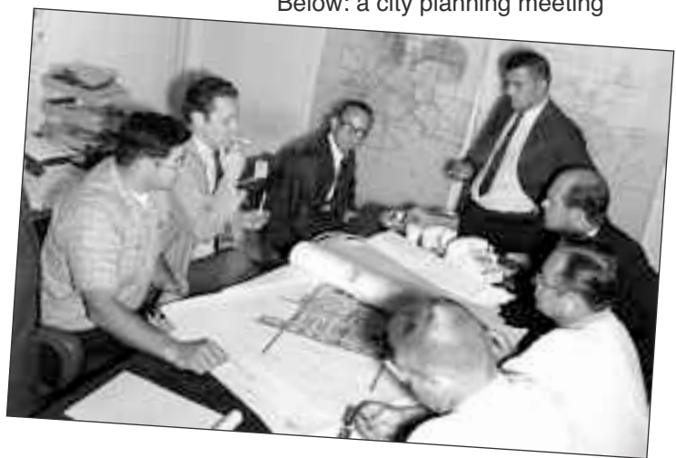
Below: a city planning meeting