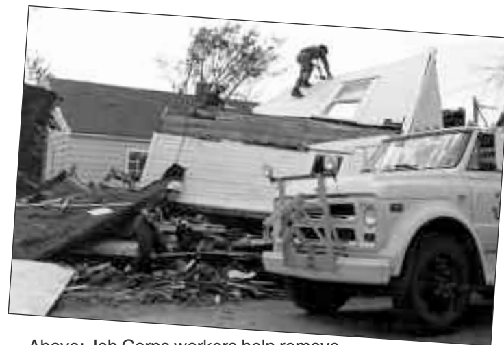
Above: Job Corps workers help remove debris