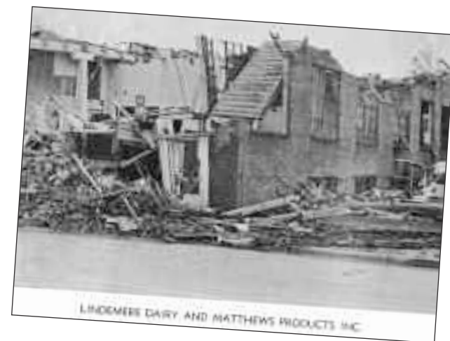
LINDGREN DARY AND MATTHEWS PRODUCTS INC