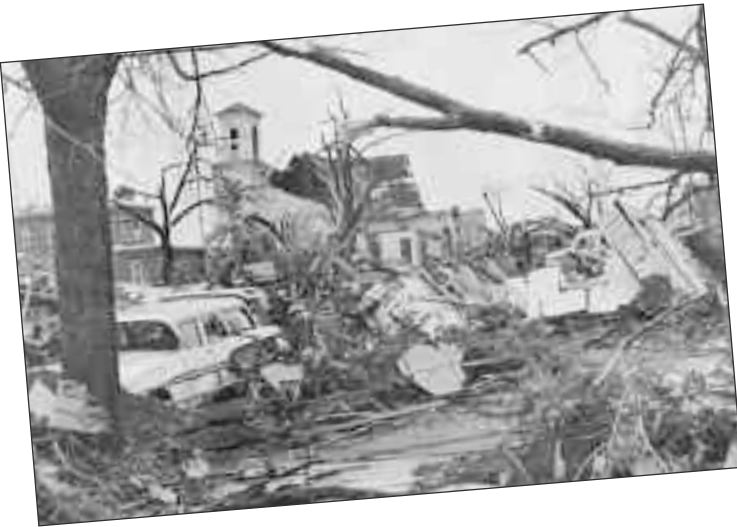
Top: Looking north from Clark Street Below: The Elks Lodge