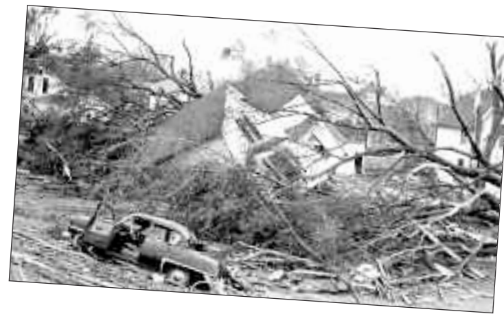
Above: Near where the VFW Post Home is today

Know the locations of designated shelter areas in place like schools and shopping centers.