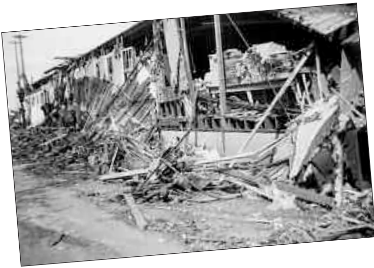
Above: Charles City Manufacturing Below: The St. Charles Hotel