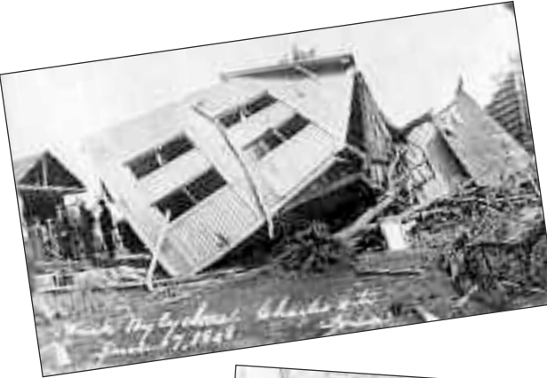
Damage from the Charles City tornado of 1908