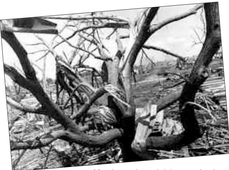
Metal, wood, nor brick proved to be a match for the fury of an F5 tornado