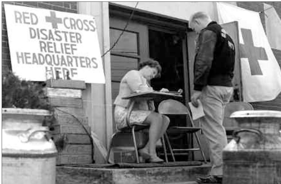
Red Cross Disaster Relief headquarters was set up at St. John Lutheran Church to aid people affected by the devastating tornado of 1968.

Damage estimates in town were put at $30 million. Translated into 2008 figures, Floyd County Emer-