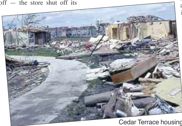
Cedar Terrace housing units were demolished

We're proud to serve the Charles City Community!