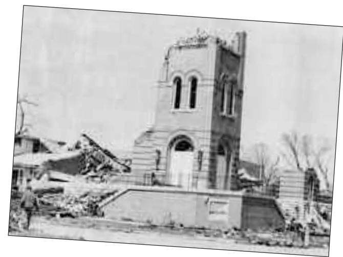
Pictured from left to right: Washington School, First Methodist Church and Central Methodist Church.