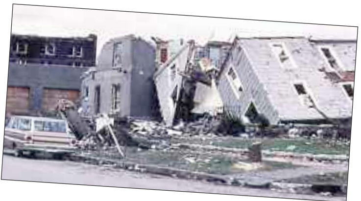
Below: This wrecked apartment house is where Sadie Chambers died