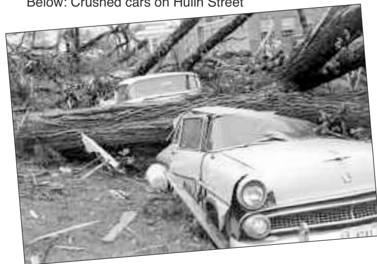
Below: Crushed cars on Hulin Street