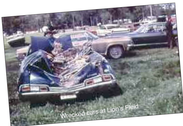
Wrecked cars at Lion's Field