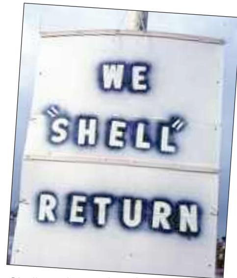
Shell service station sign