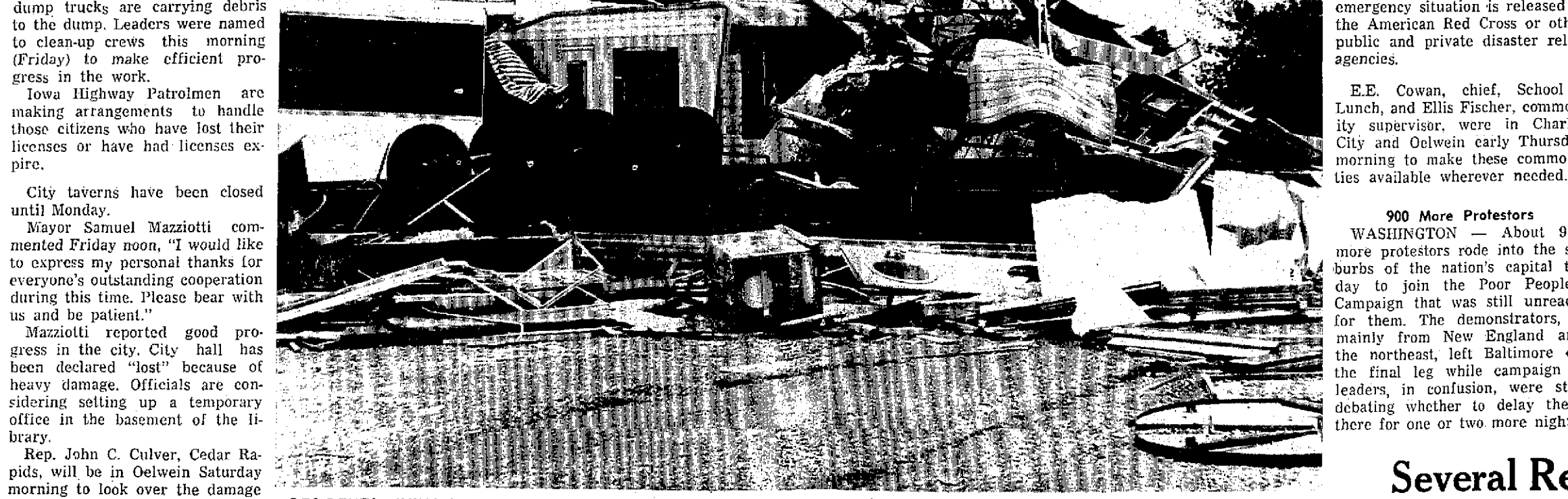
RESIDENTS LIVING NEAR VALLEY MOBILE HOMES on City Park Road were in shock after leaving their trailers at Lake View Trailer Court and looking across the 200 foot span to see absolute havoc in that area. The above photo shot by Roger Draheim, Oelwein Daily Register employe illustrates the overall scene he and his family found when they became brave enough to venture out of their trailer home and look around.

City officials and others were 896.50, making a decisive break expected to meet and discuss below the psychologically imporother possibilities about re-rout- tant 900 level.