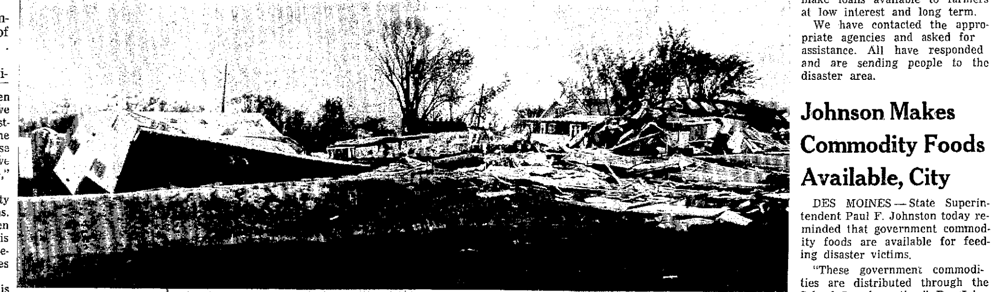
THE VALLEY MOBILE HOMES overall scene from about half way between Lake View Trailer Court and Valley indicates just a bit more of the more than $14-million estimated damage to the city of Oelwein during the 4:57 p.m. tornado which struck the city and took four lives here and at Maynard.

Across the street in what used St., then out to the dump. The to be St. Mary's Episcopal church, trucks were returning via High-