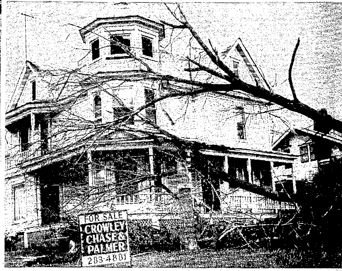
WOULD YOU BE INTERESTED?