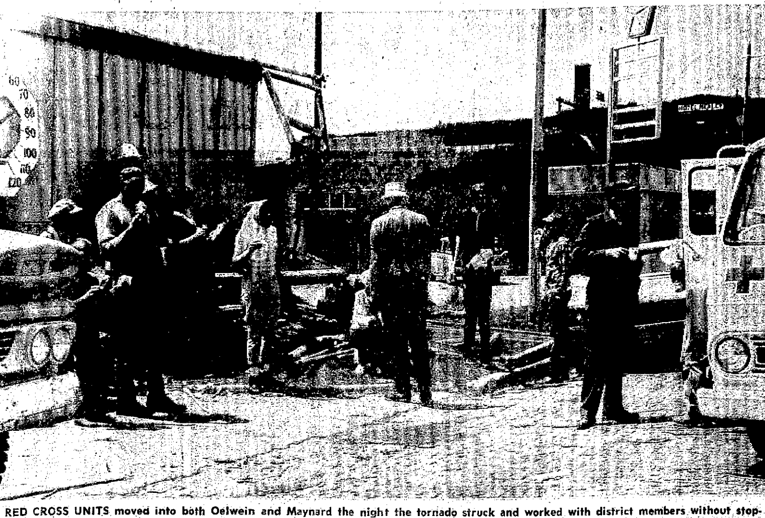
ping around the clock. Main headquarters was set up in the basement of the Presbyterian church, with a second large unit working out