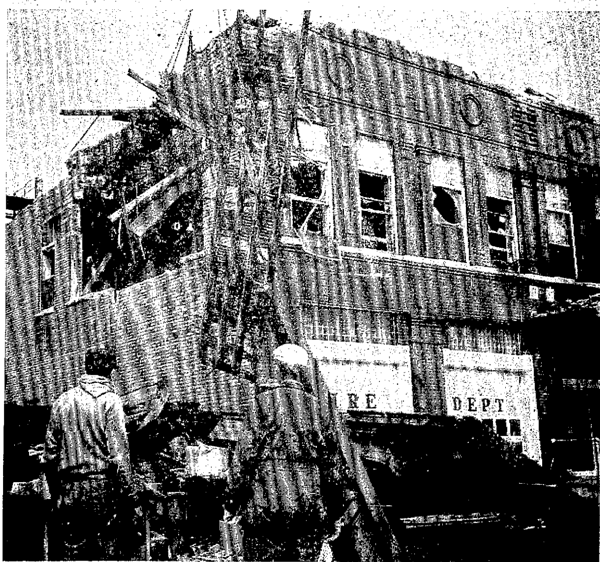
OELWEIN'S CITY HALL. The City Hall of Celwein suffered extensive damage. City officials moved back into the first floor offices Monday according to Clerk Tom Peterson. Also listed as a total loss.