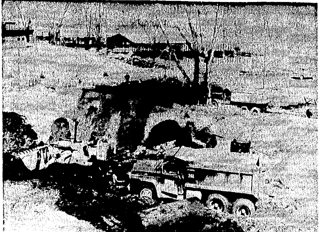
FILTER SUPPLY CORP. . . . Crews have been working two days to build a dike around this Miller industry at 580 E. 2nd St. Cooperating in the effort is Winona Industries,