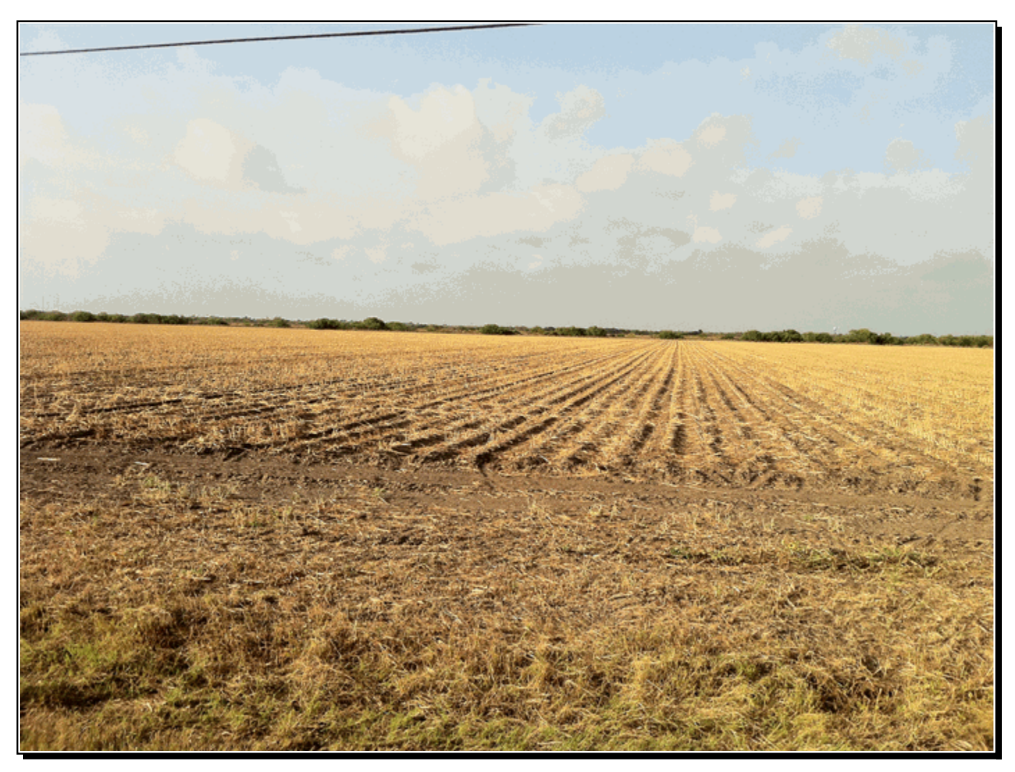
Photo of burned/stunted corn field near Los Fresnos, Texas, on June 21st, 2011 - at the peak of the worst of the 2011 Drought in Cameron County.

The rains did not arrive in time to stop millions of dollars in irrigated and dryland crop loss. According to the Texas AgriLife Extension Service, more than $8.41 million in insured losses to cotton, corn, and sorghum was reported for the entire drought period, which peaked by June 21st, for much of the Rio Grande Valley (Starr, Hidalgo, and Cameron). Willacy County data are reported in a later episode; including Willacy, listed damage was just under $9 million ($8.834 million). Livestock losses were unavailable as of this writing.