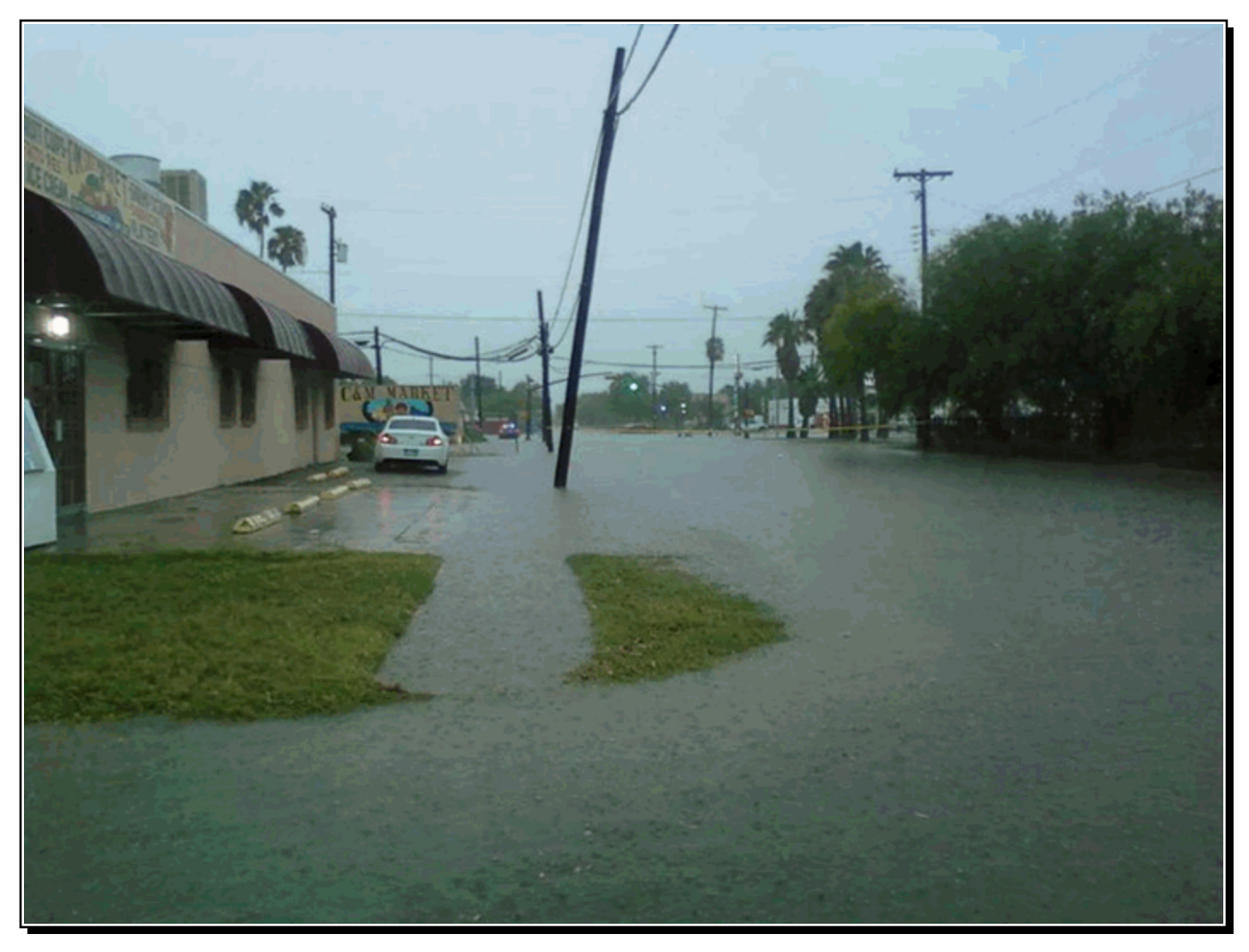
Urban flooding along 9th and Kimball in Raymondville during the mid afternoon of June 22nd. More than 3 inches of rain fell in a short time in this area.

Two day rainfall totals ranged generally from 3 to 6 inches across the Lower Valley, with peak values in a swath bounded by Weslaco/Progresso northeast to Raymondville, then southeast to Brownsville. Numerous instances of nuisance flooding, worse in areas where drainage was poor or debris had not been cleared from ditches or canals, were reported through the period.