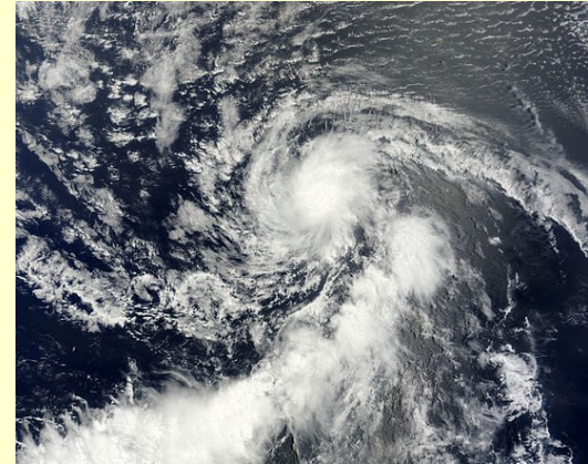
Above: Visible satellite photo of Tropical Storm Dorian over the tropical Atlantic Basin, July 25, 2013. Notice the abundant dry air surrounding the small core. Dry air was a persistent theme through the entire season.

Amid much fan-fare, a busy season was forecast by NOAA (and nearly every forecasting organization) for the Atlantic Basin, which includes much of the North Atlantic Ocean and Gulf of Mexico. By the time the season officially ended in November, 13 cyclones were observed, with only 2 hurricanes. No major hurricanes were seen. Only Tropical Storm Andrea made land-fall in the United States. These numbers were well below pre-season predictions. Why?