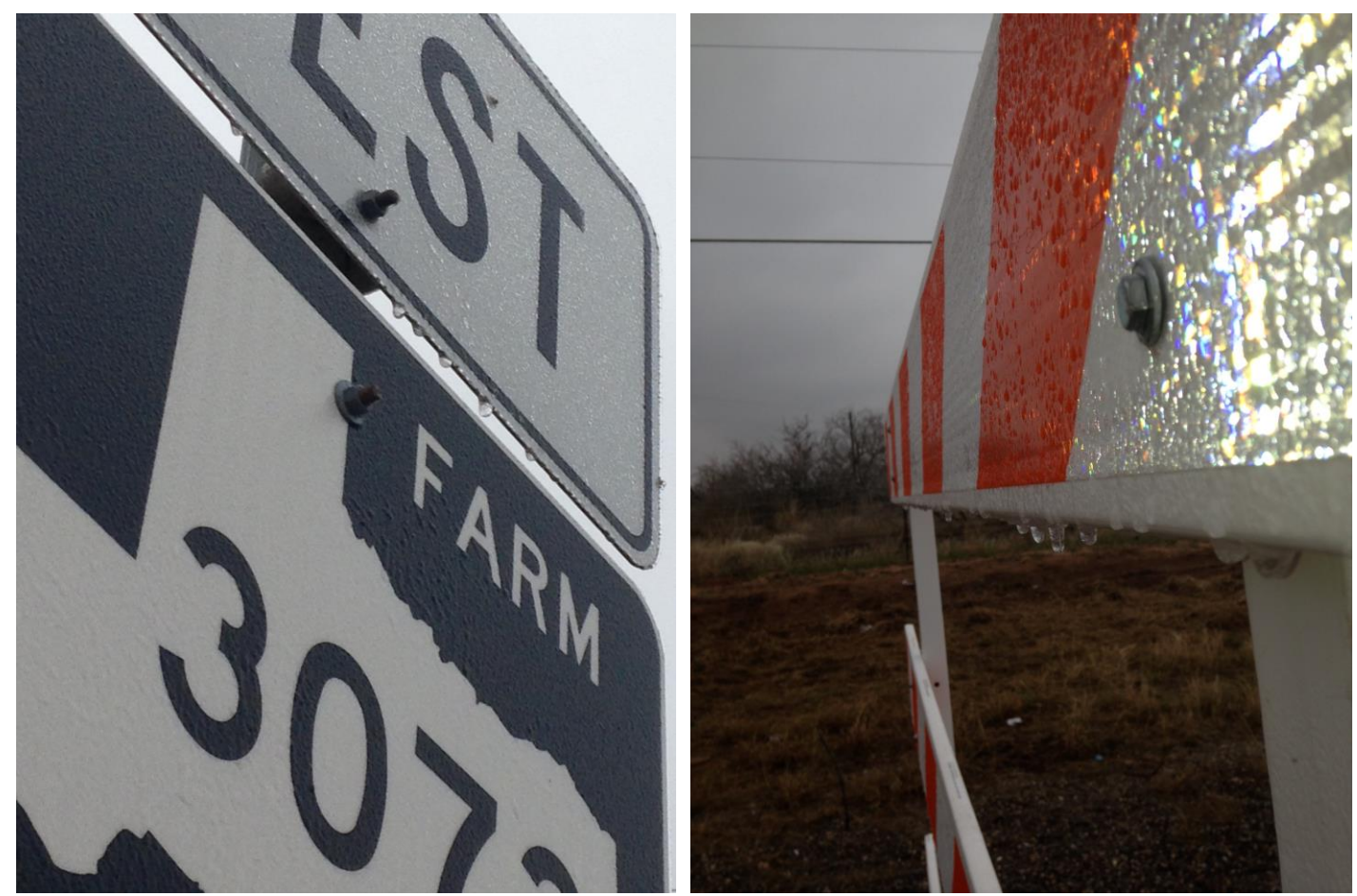
Above: Light coating of glaze from misty freezing drizzle across northern Jim Hogg County near Hebbronville, February 6, 2014.