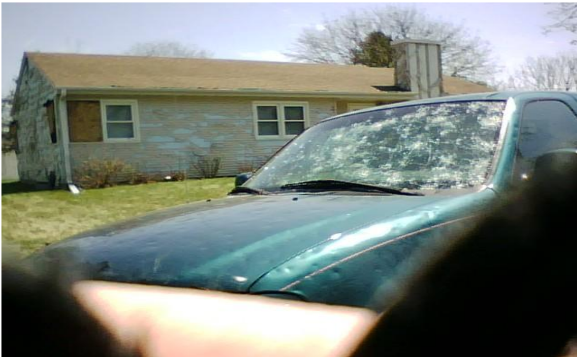
Picture of Damage from Eldora, IA. Notice the trees behind the house were stripped bare.

8. Central IA Hailstorm August 9 Thunderstorms dropped large hail across central Iowa on the morning of the 9 th , roughly along the US Highway 20 corridor, causing an estimated $200 million in damage.