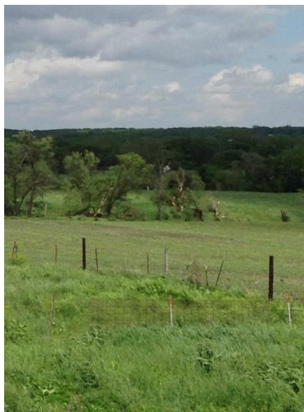
Tree damage occurred in an open field southeast of Adel. Winds estimated at 70 mph at this location.