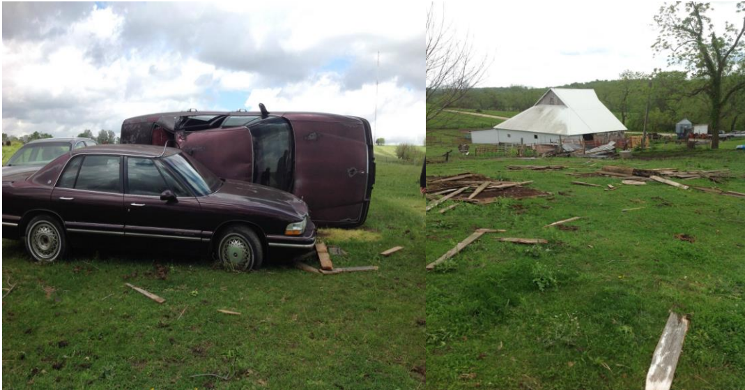
A car was flipped and building and tree damage occurred at this location. Winds estimated at 70 to 75 mph at this location.