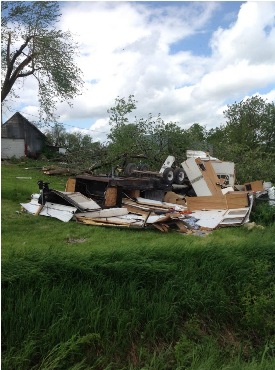
A trailer was overturned and damaged at this location. Winds estimated at 70 mph at this location.