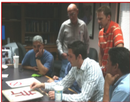
WFO Fort Worth and WGRFC staff members participate in "Diversity Scrabble."

On April 29th 2010, WFO Fort Worth and the West Gulf RFC participated in a Brown Bag Diversity Luncheon. The staff viewed a diversity-related video called "Respect My Generation." The video discussed many cultures, such as generation X, the Baby Boomers, Millennials and much more. It highlighted the obstacles people encounter when working together in the workplace.