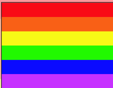
The Rainbow Flag is a symbol of Gay Pride

Unfortunately, discrimination against gay and lesbian people continues. Recent surveys indicate that over 80% of gay and lesbian people have experienced some form of verbal harassment in the last five years, and a 2009 Pew Study indicated that gay and lesbian people are now the most discriminated group in the U.S. Over half of all states still allow people to be fired simply be-