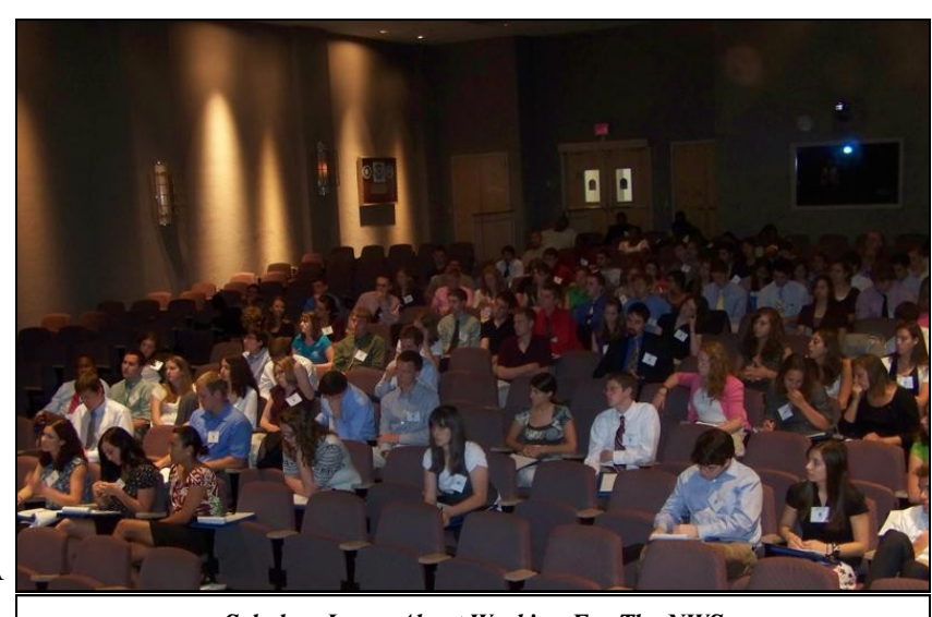
Scholars Learn About Working For The NWS

While giving students access to state-of-theart technology and facilities, they also provide many students their first "professional" jobs. Recently I gave a presentation at this orientation for the National Weather Service about "Working at a Weather Forecast Office." These future employees learned about the daily workings of a diverse WFO environment. Every office is a mixture of individuals with different backgrounds, training, lifestyles, religions, and ethnicities. To ensure a smooth transition into NOAA and NWS, our future workforce must understand and appreciate these differences. Thanks to these internships and orientations, the NOAA scholars are well-poised to do just that.