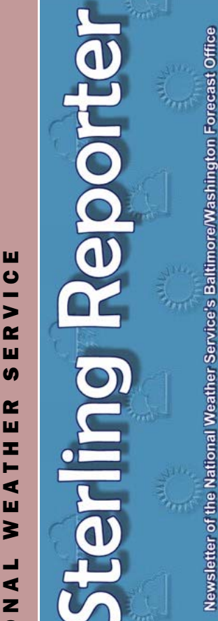
Inside this issue: