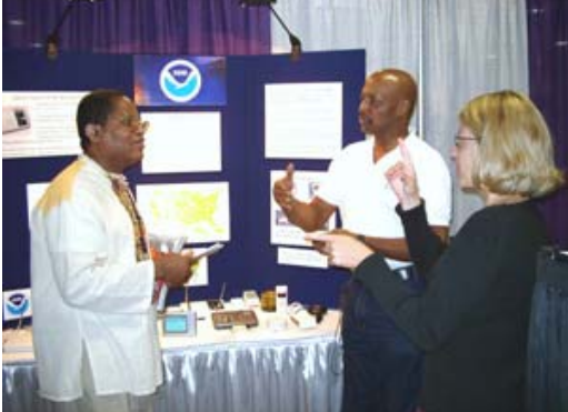
NWS Staff at Deafway II Booth at D.C. Convention Center

Gallaudet University hosted Deaf Way II at the Washington, DC Convention Center July 8-13, 2002. This was an international event with 9,000 attendees from around the world. It included deaf, hearing, hard of hearing, late-deafened, deafblind, parent, student and more. During the three days