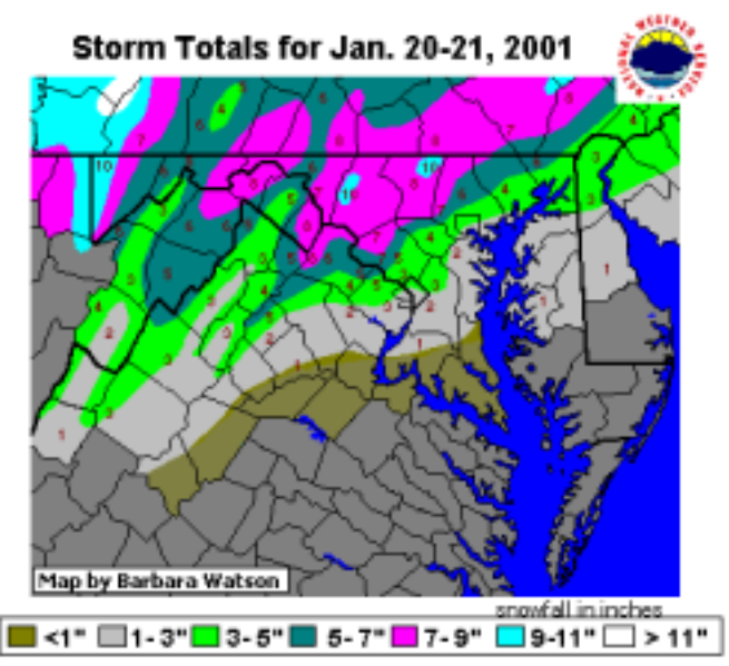
Regional Storm Total Snowfall Map from January 20th and 21st, 2001