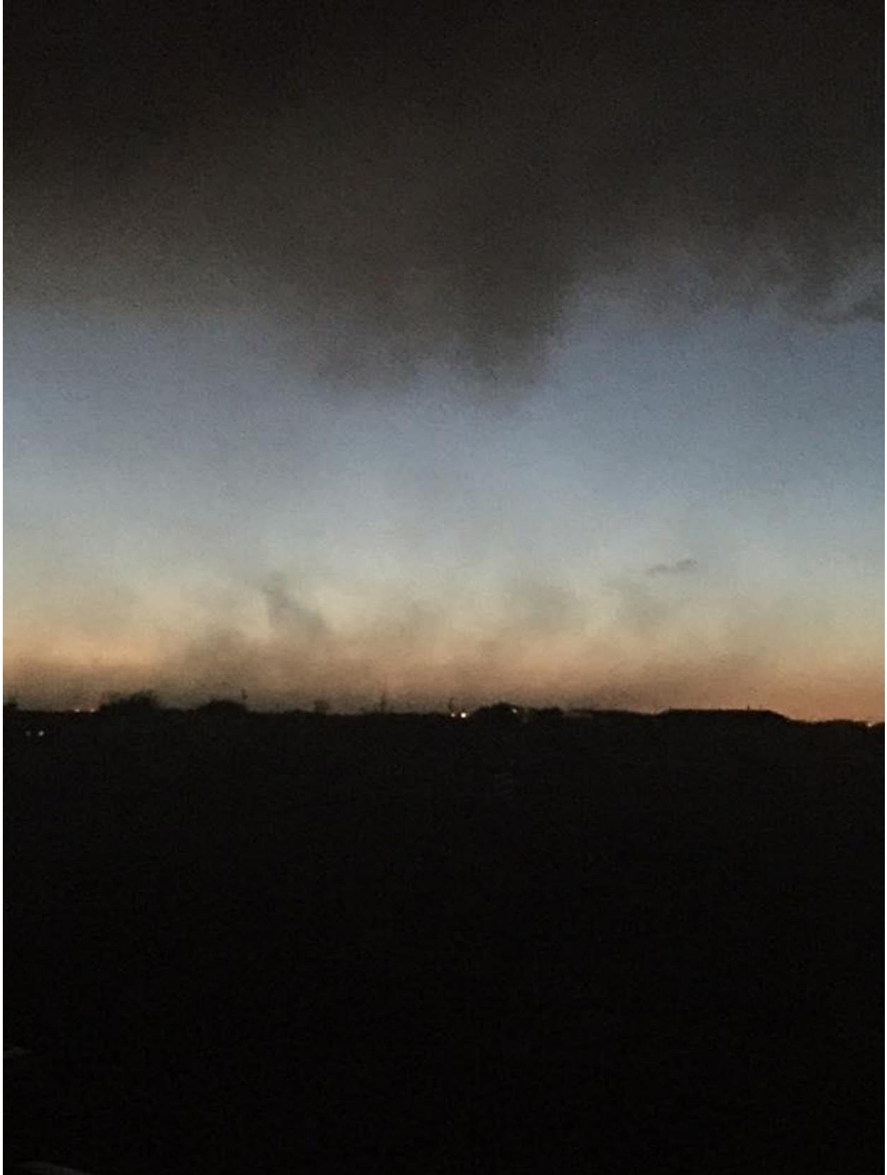
Figure 2 – Virga near Greenwood (Courtesy of Roni Jo Manley).