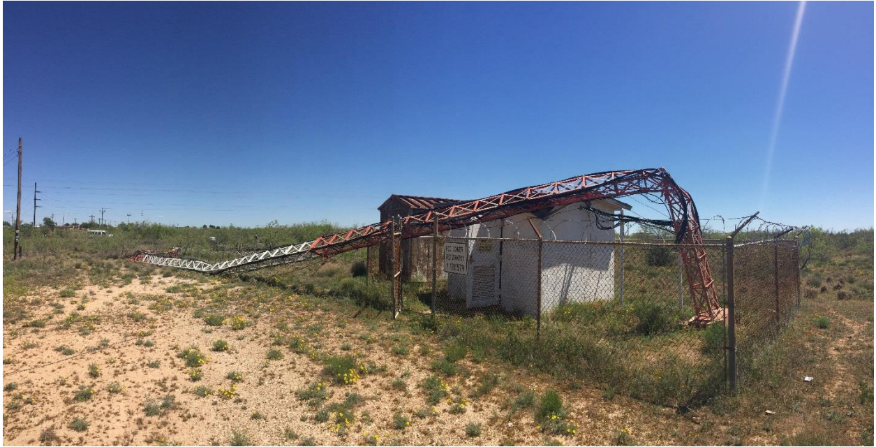
Figure 4 – Radio tower damage.