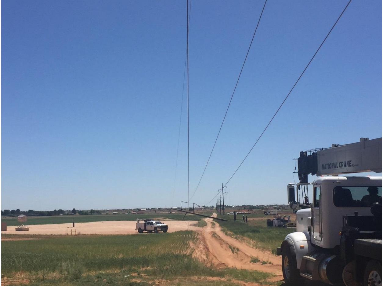
Figure 6 – Bent metal power pole.