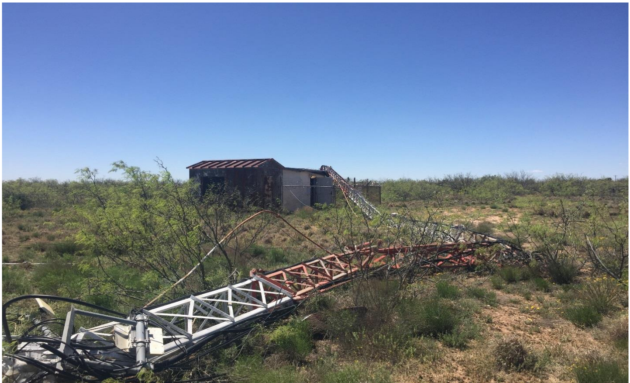
Figure 5 – Radio tower damage.