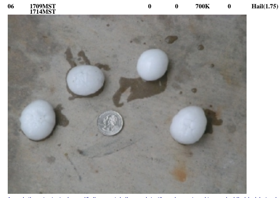
Large hail ranging in size from golfballs to tennis balls caused significant damage in and just south of Carlsbad during the early evening of the 6th.

Eddy County 4 SW Carlsbad to 6 ESE Carlsbad