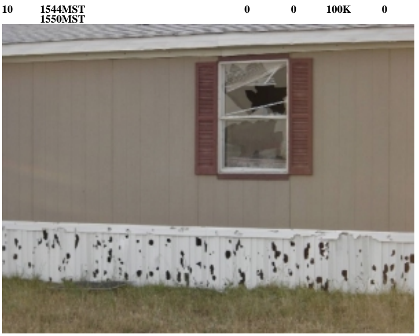
Severe thunderstorm winds combined with large hail to produce significant damage to vehicles, mobile homes, and other lightweight structures just north of Hobbs.

Local officials reported that wind gusts to 60 MPH accompanied the large hail north of Hobbs. These winds blew large hail