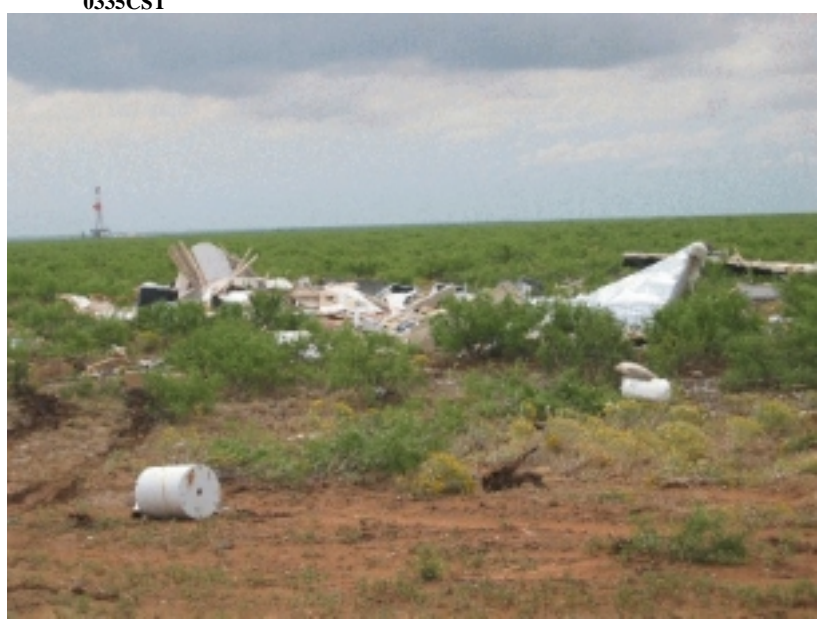
The above image shows one of three trailer homes that were destroyed at remote oil fields in eastern Loving County as destructive winds swept over the county during the early morning hours of the 26th. Three oil field employees were injured.

Destructive winds estimated to be 80 mph affected portions of Loving County. Twenty-six power poles were blown down along a five mile stretch of Highway 302 west of the Loving and Winkler County line. This resulted in widespread power outages. Three oil