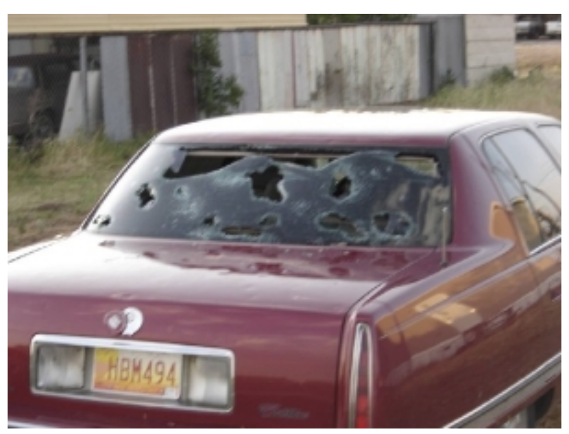
Hail up to the size of tennis balls pelted the downtown area of Hobbs during the afternoon of the 10th. The hail, which was at times wind driven, resulted in more than $400,000 dollars worth of damage.

Storm spotters reported that sporadic tennis ball size hailstones accompanied smaller hailstones in downtown Hobbs. Extensive damage occurred as windows were shattered in vehicles, homes, and businesses. No injuries were reported.