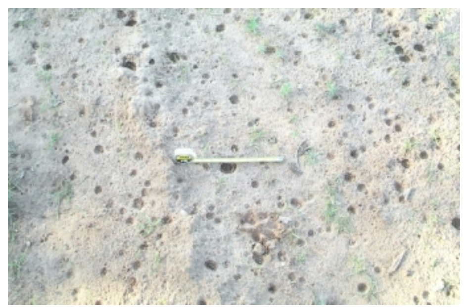
Craters up to two inches in diameter were left in the ground south of Carlsbad from large hail up to the size of hen eggs.

Hen egg size hailstones mixed with smaller hail just south of downtown Carlsbad. Storm spotters and local officials reported damage to area vehicles and homes.