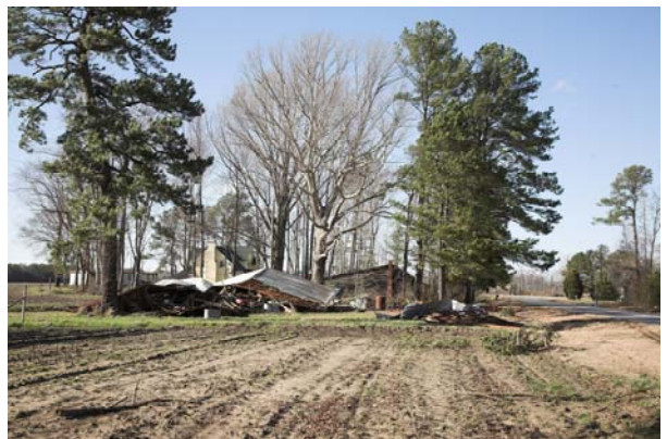
(Above pictures of Damage Along Highway 17 in Beaufort and Martin Counties)

The tornado touched down again briefly approximately 5 miles southeast of Williamston, near the intersection of Holly Springs Church Road, and J.T. Heath Road. Here it destroyed one out building and took the roof off another. It also destroyed a car port.