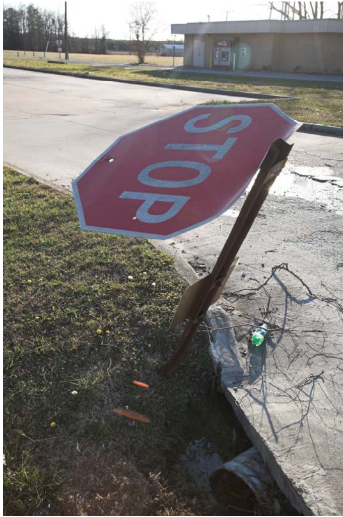
(Above pictures of Damage in and Near Jamesville, in Martin County)