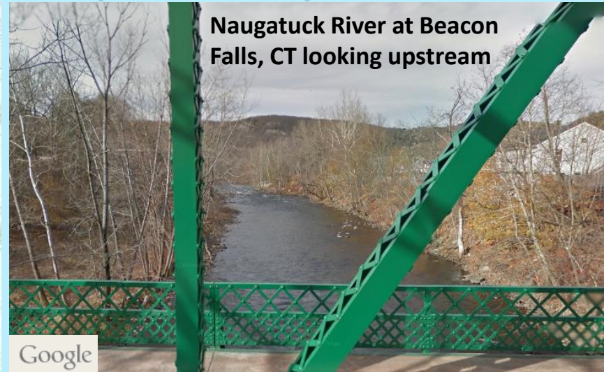
Naugatuck River at Beacon Falls, CT looking upstream