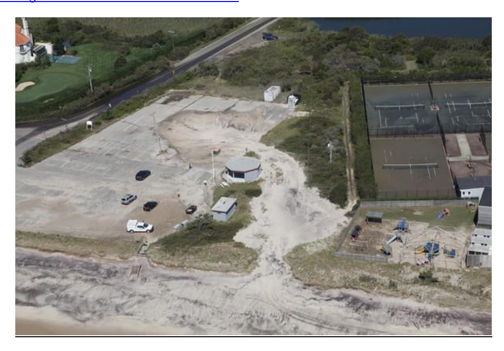
Amagansett- 1 to 2 ft flooding at intersection of Indian Wells Road and Bluff Rd

<u>Bridgehampton</u> – 2 to 3 ft of inundation along Mecox Bay. Washovers at <u>Bridgehampton Tennis</u> <u>Club parking lot with inundation onto Job Lane</u>.