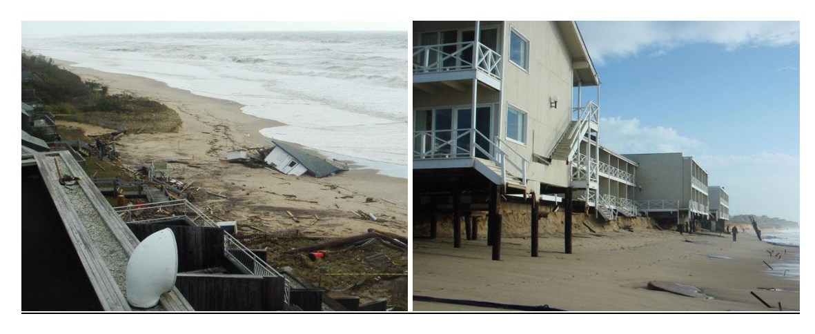
<u>Springs</u> – A line of dunes at Louse Point, Springs, was leveled, as sand, water, and debris poured across the road, filling several properties. Gerard Drive was submerged by mid-morning Monday...and still impassable on Wednesday...leaving these houses cutoff.