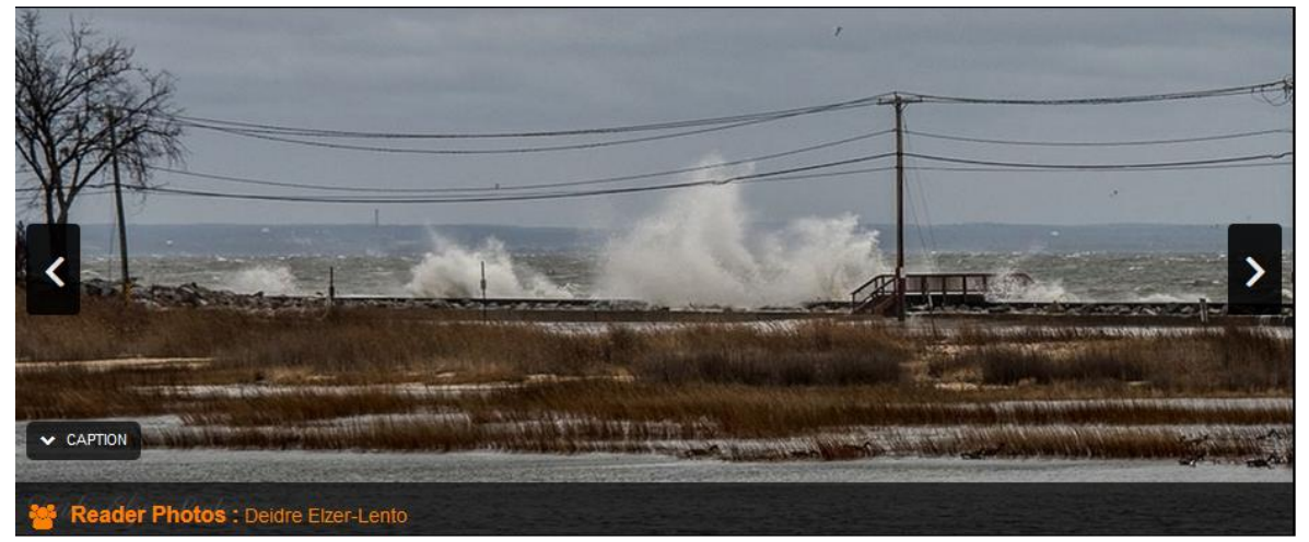
Glen Cove - Pryibil Beach was closed Monday afternoon and evening because of flooding