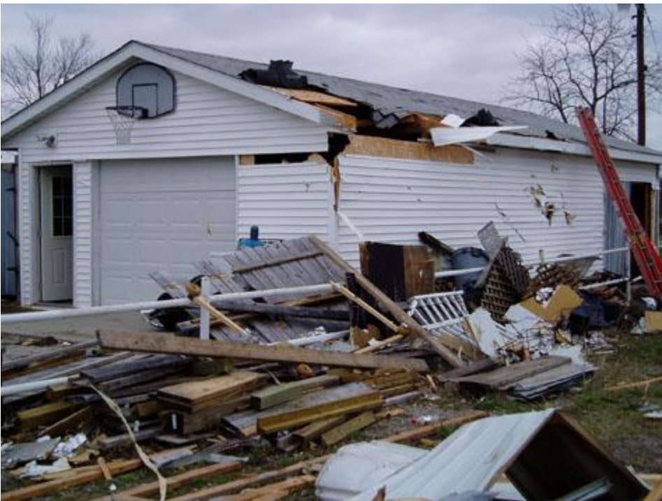
Damage to a house near the Fairfield Airport