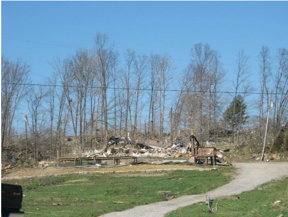
Mobile home destroyed near Greenville Rd/Gleason Lane