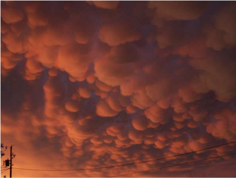
Mammatus clouds behind the April 2nd storms over Sesser, Illinois at sunset.