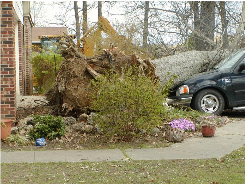
Alternate view of tree on three vehicles in Dexter, MO