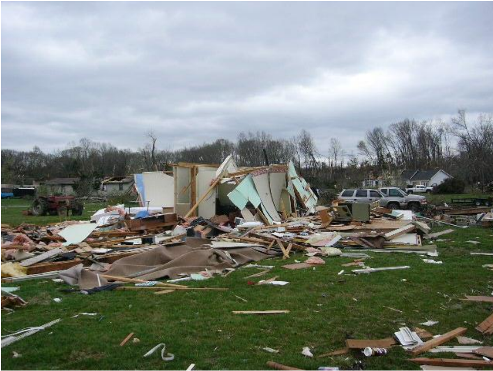
Destroyed home on Princeton Road