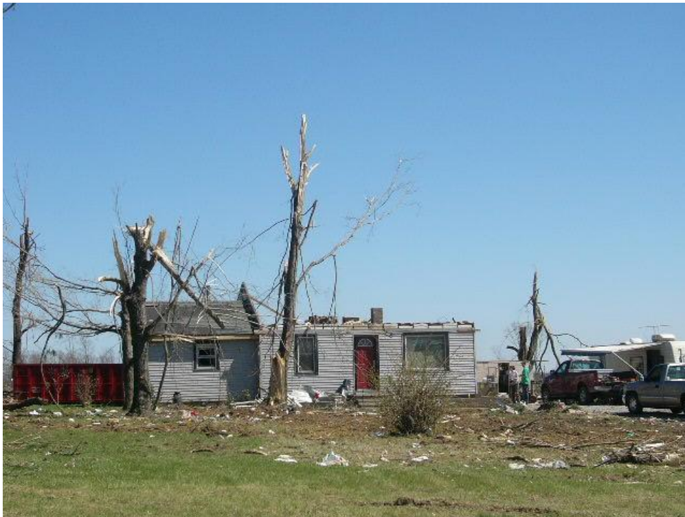
Damaged house on Greenville Road