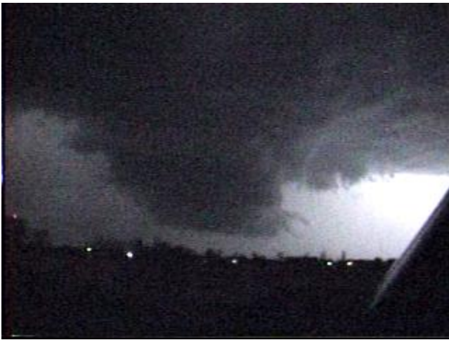
Wall cloud lit up by lightning