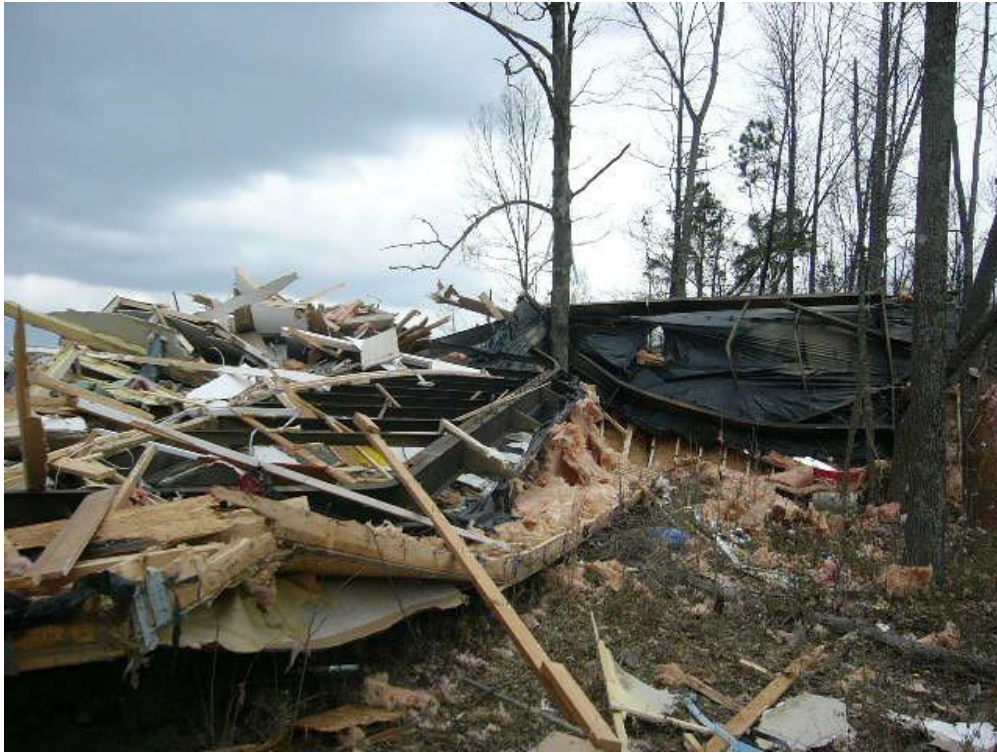
Mobile home wrapped around a tree near Dawson Springs Road.