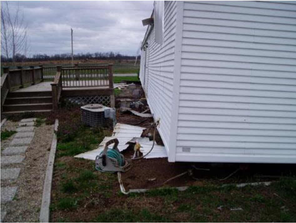
Mobile home moved off its foundation one half mile north of the Fairfield Airport