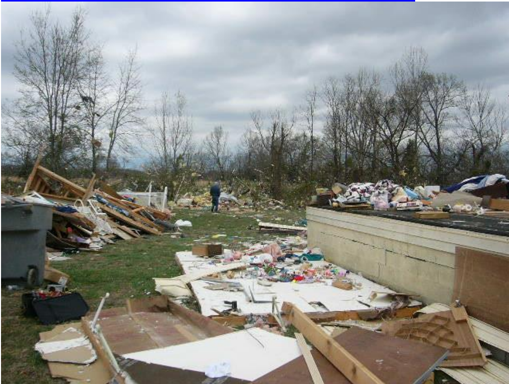
House destroyed on Billy Goat Road