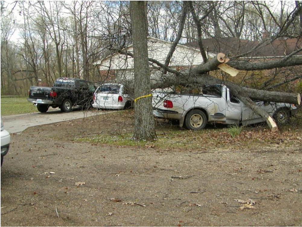
Tree on three vehicles in Dexter, MO