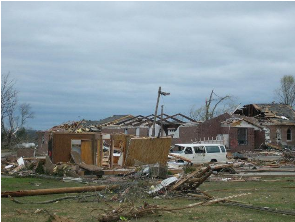
Damaged homes on Princeton Road