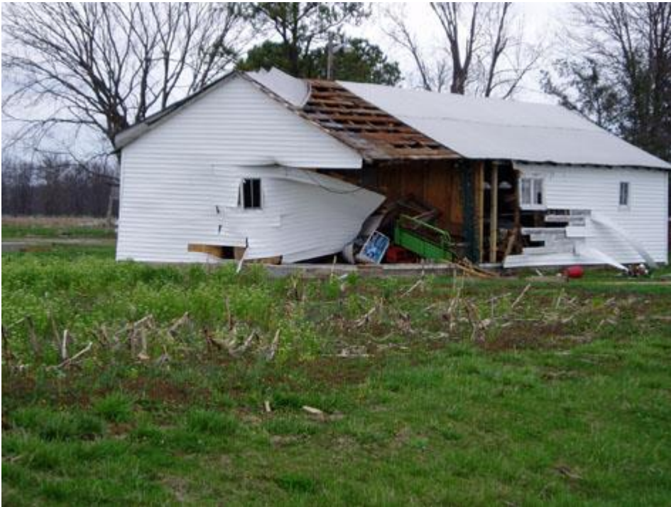
Damage to a garage in Boyd, IL (Jefferson County)