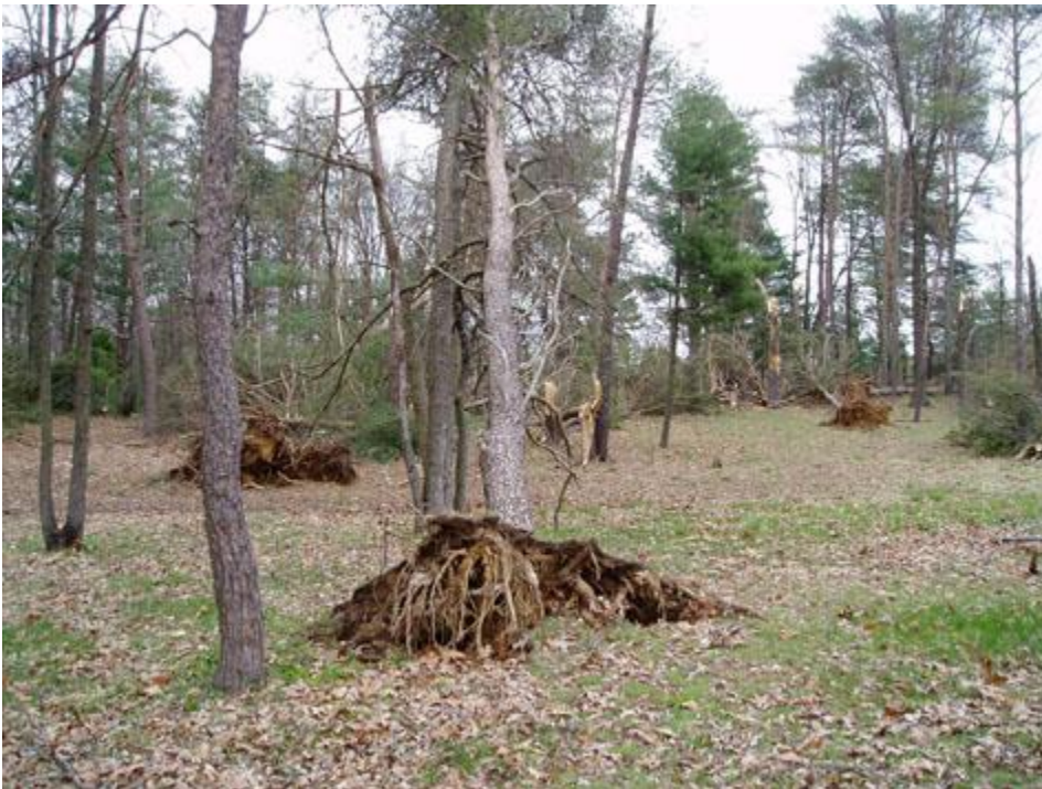
Uprooted and snapped trees in Fairfield, IL