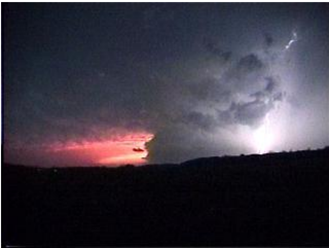
Looking west toward the tornadic storm moving across McCracken County

A BRIEF F0 TORNADO TOUCHDOWN WAS REPORTED EAST OF THE SMALL TOWN OF GAGE KENTUCKY...JUST INSIDE THE MCCRACKEN COUNTY LINE NEAR HIGHWAY 286. THIS SUPERCELL STORM ACTUALLY FORMED IN STODDARD COUNTY MISSOURI...CROSSED THE MISSISSIPPI RIVER AND SPAWNED THIS BRIEF F0 TORNADO IN MCCRACKEN COUNTY. THIS SUPERCELL STORM THEN MOVED EAST AND EVENTUALLY PRODUCE THE F3 TORNADO IN CHRISTIAN COUNTY, KY. THE FOLLOWING PICTURES WERE TAKEN AS THE STORM CONTINUED TO MOVE ACROSS MCCRACKEN COUNTY.