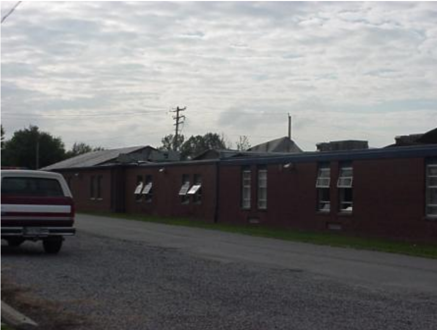
Above: Photo of damaged grade school in Woodlawn, which is several miles west of Mount Vernon near I-64

* DISCUSSION/DAMAGE: SEVERAL HUNDRED HOMES WITH CONSIDERABLE ROOF DAMAGE DUE TO WIND DAMAGE AND FALLEN TREES. MANY LARGE LIMBS AND SOME TREES FALLEN ON HOUSES. SEVERAL THOUSAND TREES DOWN THROUGHOUT THE COUNTY. CONSIDERABLE CROP DAMAGE...ESPECIALLY NEAR MOUNT VERNON. TRACTOR TRAILERS OVERTURNED ON THE INTERSTATE.