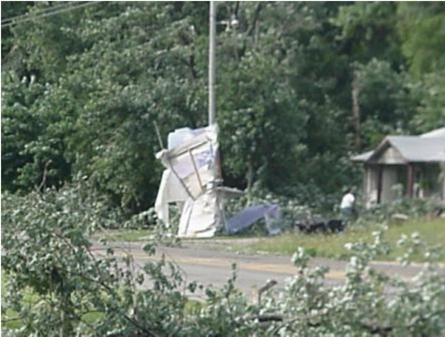
Above: Damage in southeast Mount Vernon