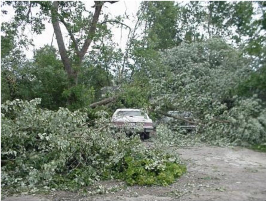
Above: Tree damage was extensive in Mount Vernon