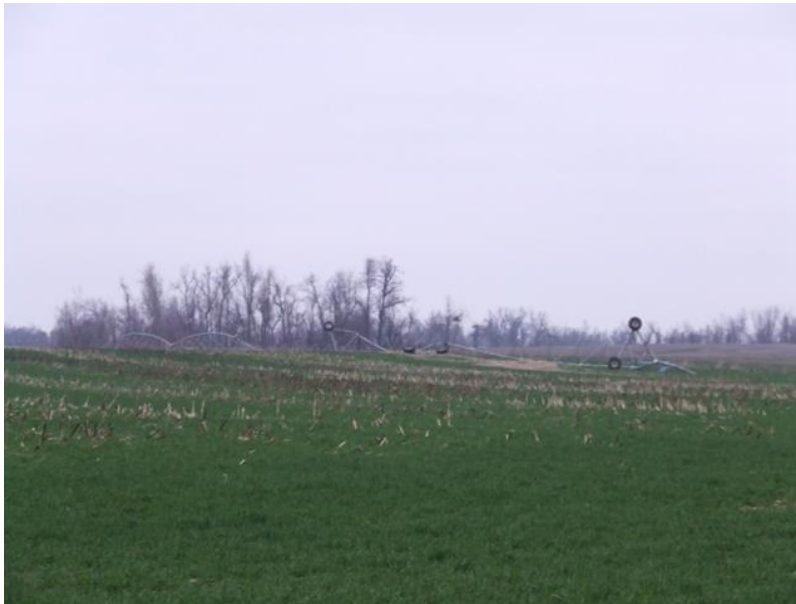
IRRIGATION RIG OVERTURNED. LOCATION WAS ACROSS THE ROAD FROM THE GRAIN BIN DAMAGE.