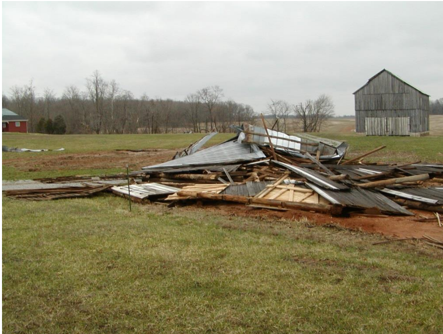
BARN DESTROYED ON EVERETTE LANE