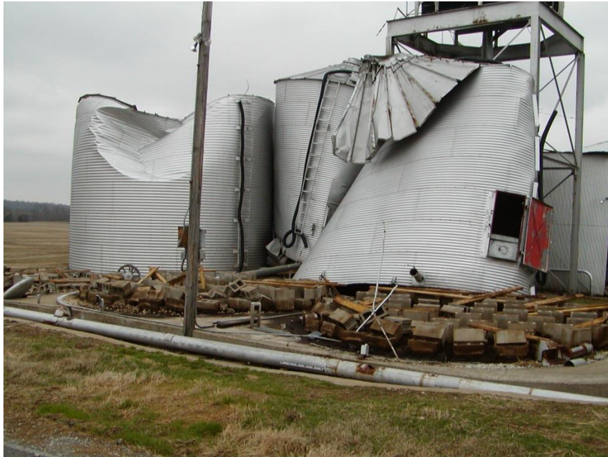
GRAIN BINS HEAVILY DAMAGED ON CAMPBELL LANE