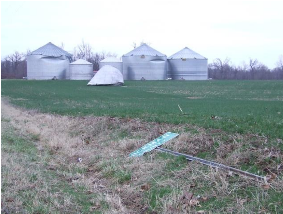
COUNTY SIGN BLOWN DOWN AND GRAIN BIN DAMAGE. GRAIN BIN IN FOREGROUND WAS LOFTED SEVERAL HUNDRED YARDS FROM A FARM TO THE SOUTHWEST.