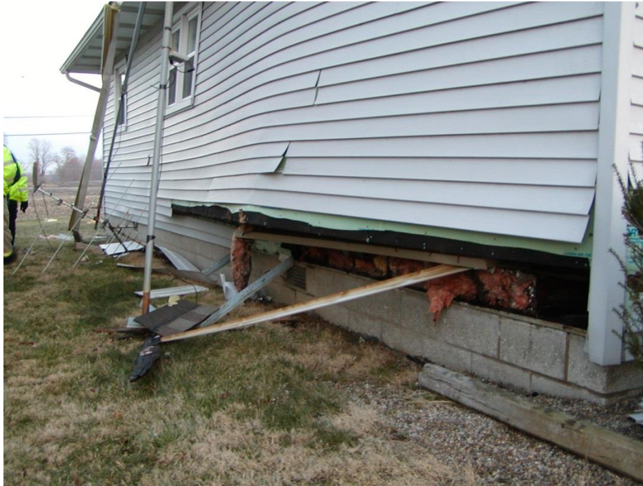
Tornado damage to a home in Oakland City.