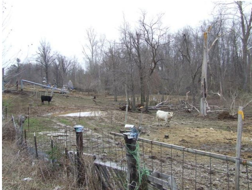
A BETTER VIEW OF TORNADO PATH SHOWING TREES UPROOTED...POLES BENT AND DESTROYED BARN.