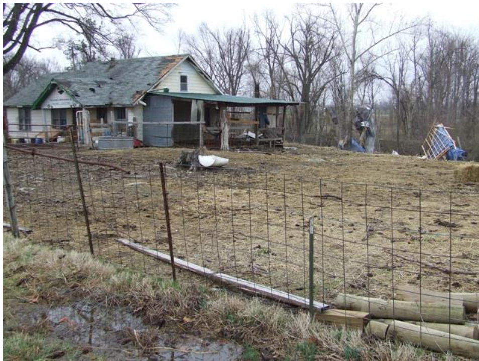
A HOME SUSTAINS ROOF DAMAGE AND A BARN IS DESTROYED ON HWY 45 SOUTHWEST OF FANCY FARM