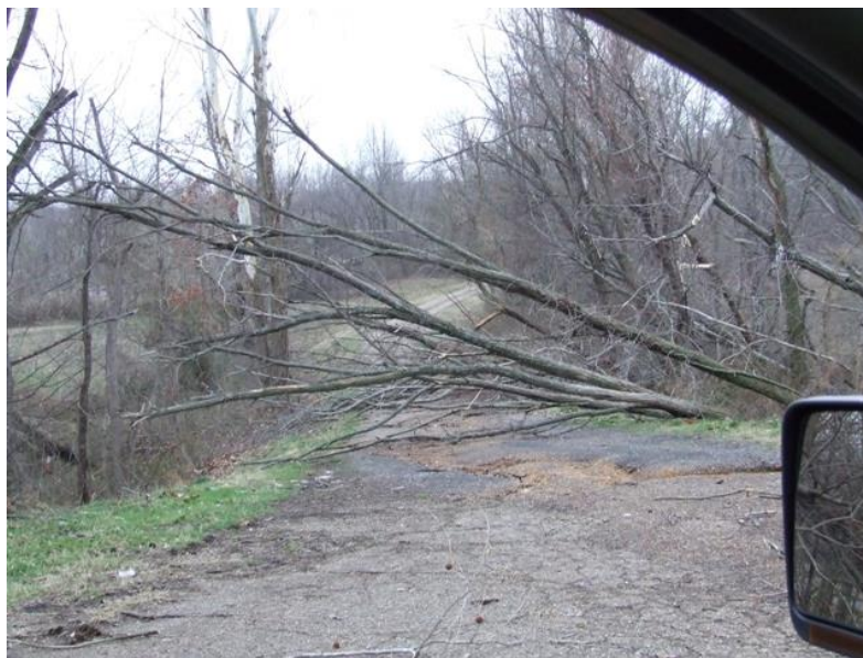
TREES UPROOTED/SNAPPED ON HOLLAND LANE AT THE OVERPASS OVER PURCHASE PARKWAY. PURCHASE PARKWAY SEEN IN THE BACKGROUND - LOOKING SOUTH (HICKMAN CO)