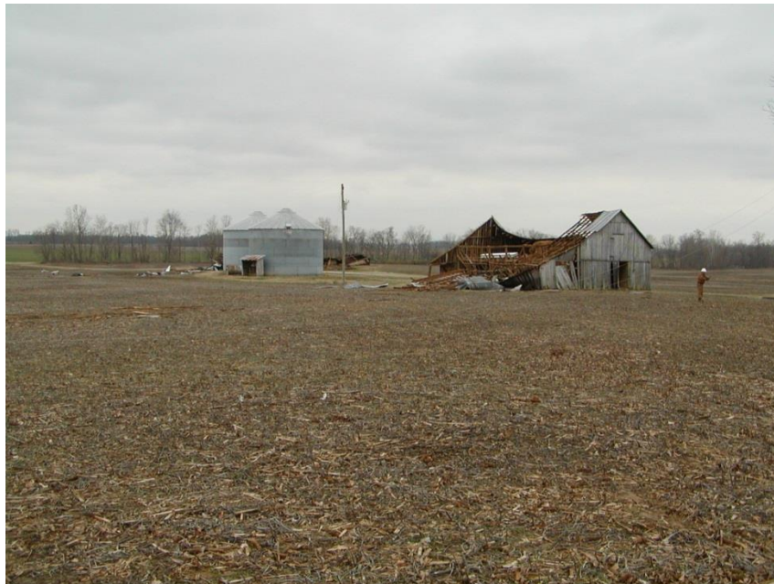
BARN DESTROYED ON PRINCETON ROAD.