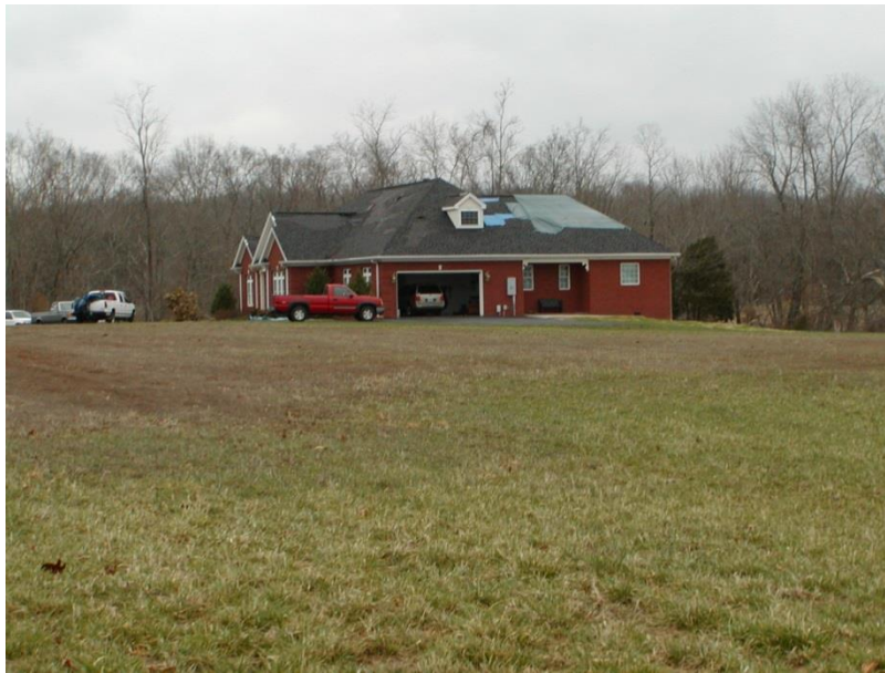
HOUSE SUSTAINS ROOF DAMAGE ON EVERETTE LANE