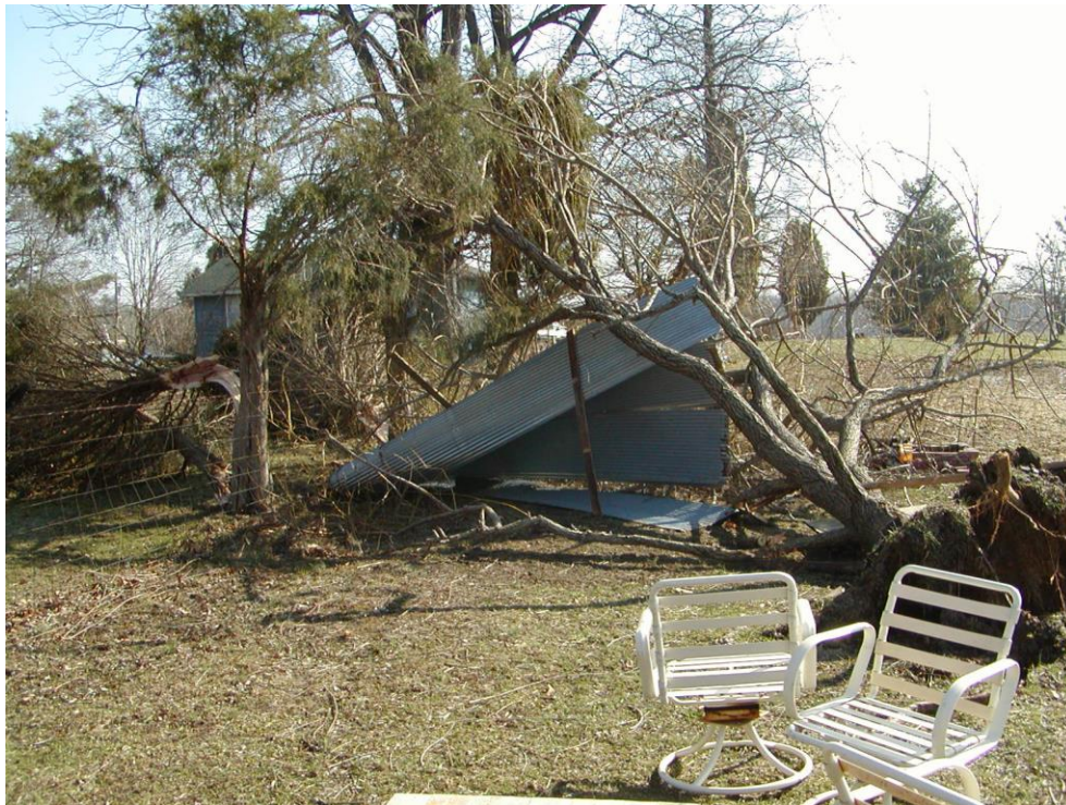
Uprooted trees and broken tree limbs, along with a piece of a grain silo, were found near Oakland City.