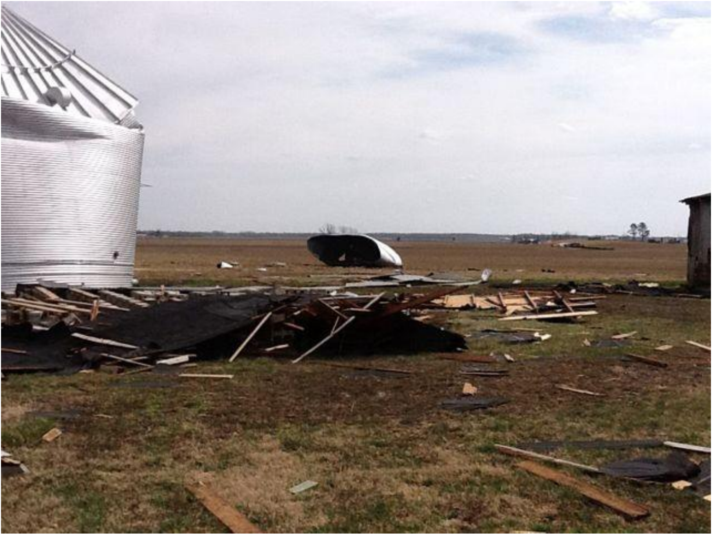
Damage west of Corydon - grain bins damaged/destroyed.

Below is a list of preliminary reports from Friday's storms. More information will be provided as it becomes available: