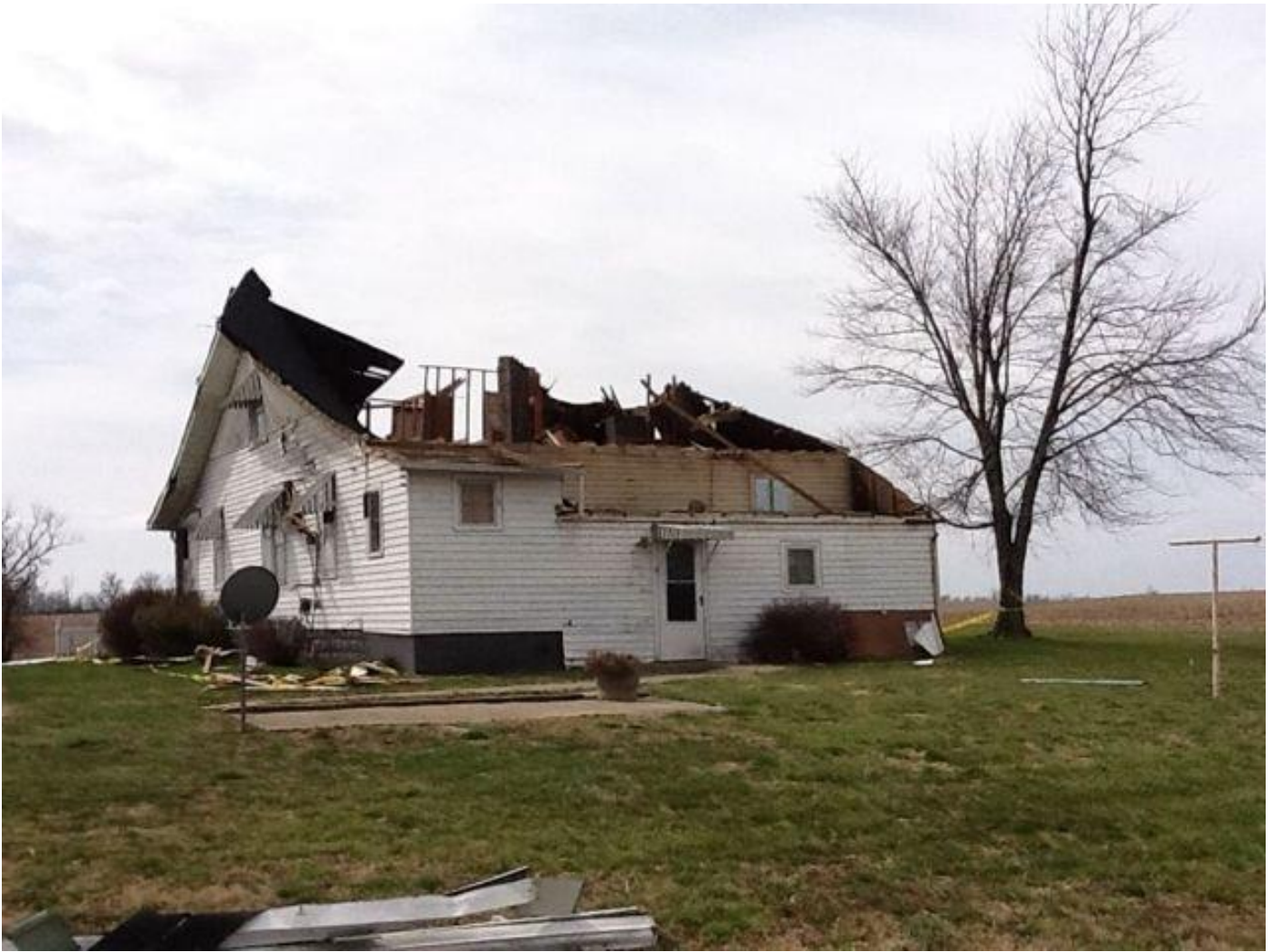
Home damaged 5 miles west of Corydon