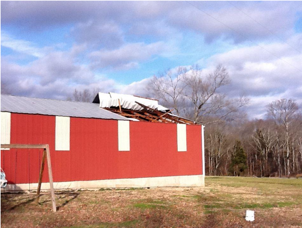
Pole Barn/Garage damaged in New Providence