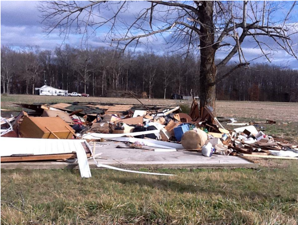
Demolished garage on New Providence Road