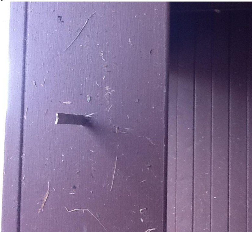
Projectile - Craig Road just east of Hazel