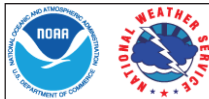
NOAA emblem and NWS logo