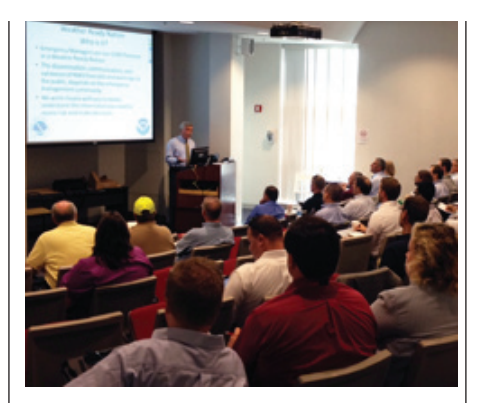
Ninth NWS Albany, NY, Emergency Managers meeting taps EM expertise.

The ninth NWS Albany, NY, Spring Emergency Managers Forum on June 6 tapped partner expertise to increase value. The meeting drew federal, state, and local EMs from