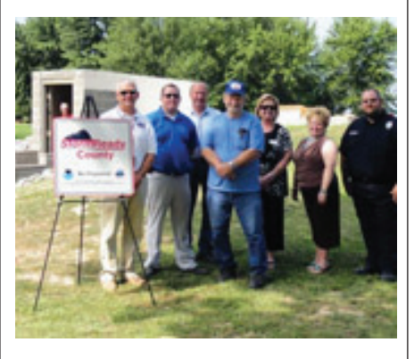
Bandana, KY, a new StormReady community, residents came together to create a community tornado shelter, pictured rear.

The group funded the cost of converting the plant to a tornado shelter by selling scrap metal from the upper part of the structure. The recycled metal paid for a stairwell into the underground shelter, along with an extra heavy door, weather radio and TV. Bandana residents donated the labor.