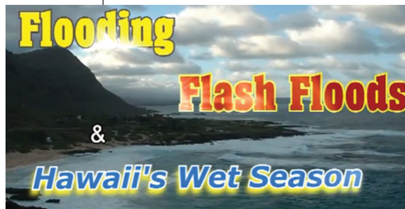
A new flash flood video includes dramatic footage of local floods visualizes the impacts of flooding.