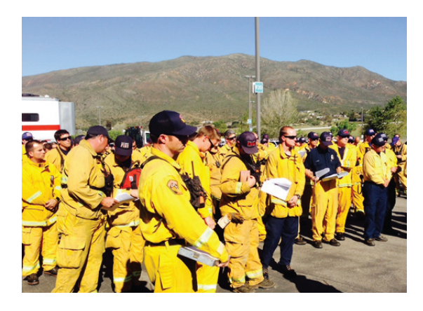
The 9 am briefing gathers over 300 fire fighters and strike team leaders to hear the weather forecast and planning.

Much of California is experiencing one of the worse drought conditions of this century and the warmest winter season on record for all of southern California. Fire behavior has been reported by veteran crews as extreme and persistent through the winter months. Due to three seasons of precipitation deficits coupled with just enough moisture for grasses to grow and cure, fire behavior analysts fear extreme wildfire growth and behavior in 2014. In the past 3 years, the mountains and foothills, which are most prone to severe wildfire potential, have received just 50 percent of normal precipitation.