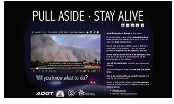
A dust storm safety video can be found online at pullasidestayalive.org

Blowing Dust is a significant societal issue in Arizona spanning many different disciplines and is also the third deadliest weather related phenomenon in Arizona, after heat and flooding. The highly travelled stretch of Interstate 10 between Phoenix and Tucson is especially vulnerable to dust and has been the site of numerous fatal accidents in the past 5 years.