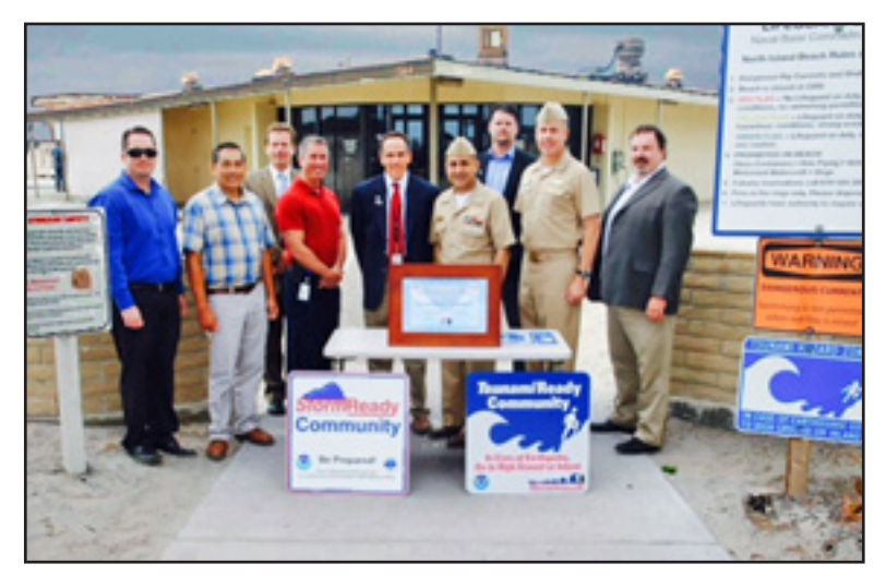
TsunamiReady and StormReady recognition ceremony at Naval Base Coronado, CA, in June 2014.

To refine the draft guidelines, researchers worked with a series of focus groups that included emergency managers (EM) and community stakeholders in tsunami risk areas.