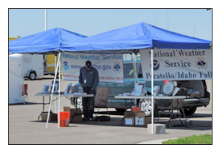
NWS Pocatello weather briefing tent oniste at the "Ragin Stagin" functional exercise

On June 6-7, at the Rexburg High School property, over 60 entities including sheriff offices, search and