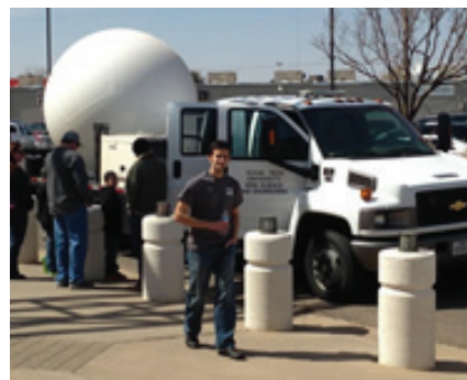
TTU students displaying a Ka-band Mobile Doppler Radar.

NWS Lubbock held one of the most successful awareness events at the Science Spectrum where Lubbock staff presented with other key partners such as the Texas Tech University Student Chapter of the American Meteorological Society and KCBD News Channel 11. This day-long event included hands-on weather experiments, severe weather preparedness displays,