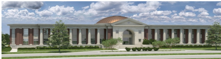
National Water Center, Tuscaloosa, AL

NWC will align NWS resources into a water enterprise that supports grand challenges in water resources, such as hydrologic extremes, water security, and water/ecosystem interactions, as well as emergency services. These goals are fully aligned with, and an integral