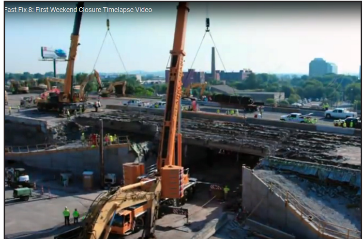
A time lapse video captured of one of the weekends during the Fast Fix 8 project.

During two of the weekends, there was active weather, including thunderstorms. NWS Nashville provided specific impact-decision support services in real-time to ensure the project was safely halted until thunderstorms passed.