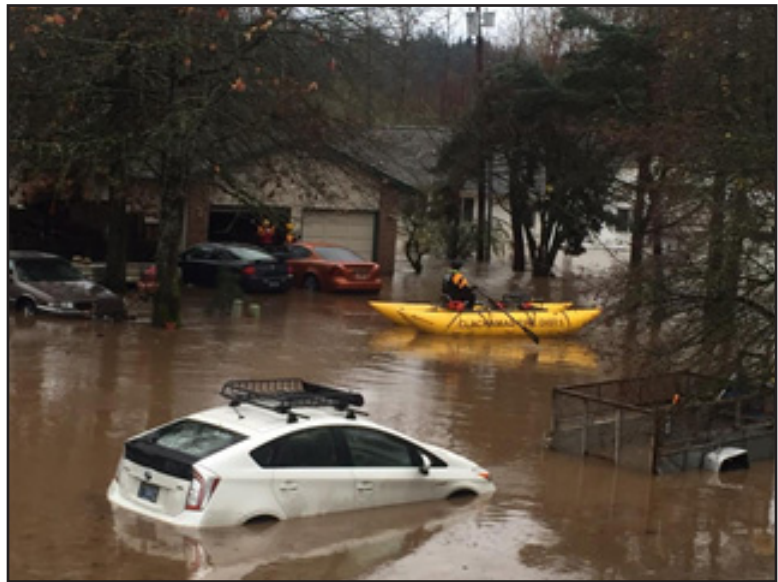
Record Flooding in the Pacific Northwest turned roads into rivers.

The event demonstrated the value of DSS provided by the NWS leading up to and during an episode of historic rainfall and flooding. Briefings, forecasts and other DSS provided by WFOs Portland and Seattle, assisted in evacuation decisions and life and property being saved. These WFOs worked with their emergency management partners and communities to build a Weather-Ready Nation.