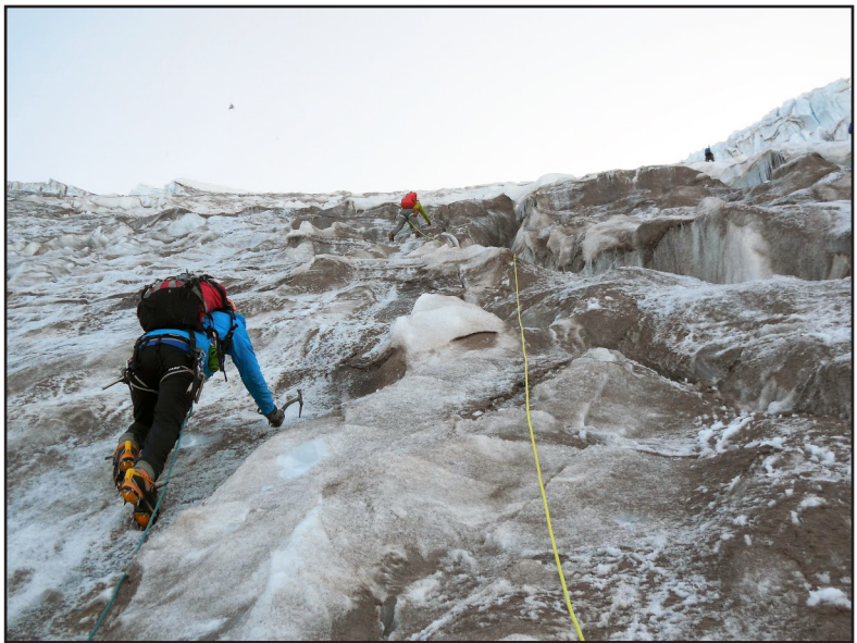
Climbing the Kautz, WA, ice chute

The new impacts statements explicitly detail what the weather will mean for people on the mountain, rather than leaving that interpretation up to the individual. For example, instead of simply stating the winds on the mountain will be 40 mph, the statement adds that climbers will need GPS for safe navigation, that it will be difficult to even set up their tents, and that they will be in dangerous blizzard-like conditions. NWS hopes these specific possible impacts will help users make a more realistic assessment about whether or not to set out on a climb or hike.