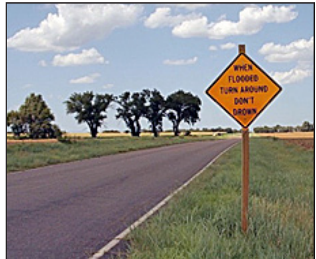
Turn Around Don't Drown sign in Kingman County, KS, before dangerous flooding point.

NWS is hoping to continue the program but sites are encouraged to purchase signs as well to ensure the safety of local residents. Find more information, see the Turn Around Don't Drown website.