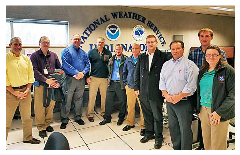
Pictured above are NWS and IDEM Air Quality Group forecasters.

The NWS forecasters shared tools and techniques they use that may help IDEM staff prepare more accurate air quality forecasts. NWS staff also discussed our Weather-Ready Nation vision and Ambas-