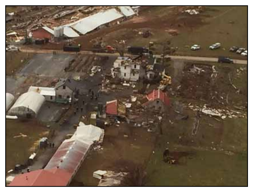
Damage caused by an <u>EF2 tornado which struck near White Horse, PA</u>, on February 24, 2016

Additionally, the Federal Communications Commission now requires participating wireless carriers to support an increase in WEA message length from 90 to 360 characters on 4G LTE and future networks by the middle of 2019. According to NWS WEA Program Lead Mike Gerber, the wireless industry is starting to work out the details. Users may need new cell phones to receive the longer 360 character messages.