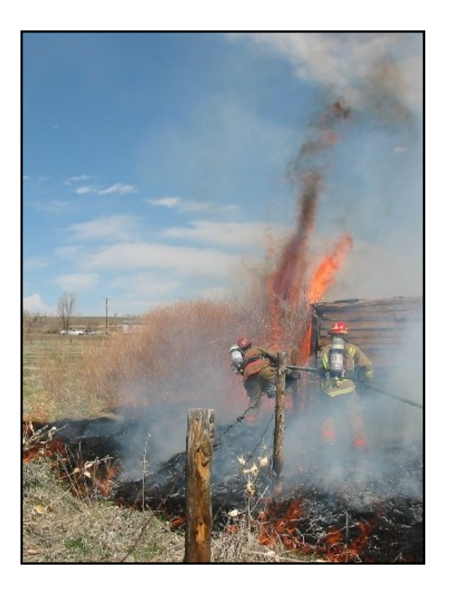
Help Minimize Wildfire Losses in Wyoming