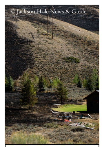
The Little Horsethief Canyon Fire near Jackson was started in 2012 by a backyard burn that got out of control. It cost over $9M to fight.

Get informed and prepare before you strike a match.