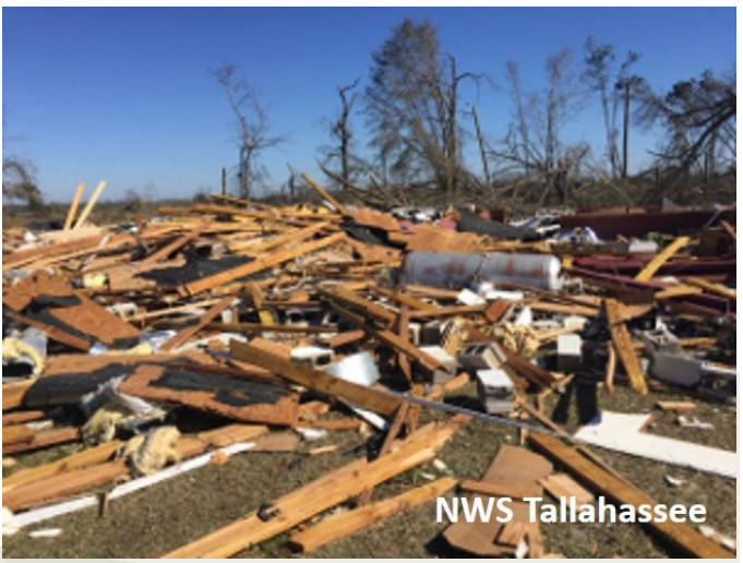
Church in Worth county destroyed by a tornado on Jan 22, 2017

The unofficial tornado season in the Tallahassee forecast area runs from November 1 to May 15, with a typical peak mid February through early April. While we can get tornadoes outside of this season, it is during this winter and spring period that we have our greatest risk for significant (EF-2 or higher) tornadoes. This January, within this seasonal window though outside its typical peak, the tri-state area saw 2 tornado outbreaks which produced a total of 8 significant tornadoes. On Monday January 2, 2017, a strong line of thunderstorms moved through southeast Alabama, southwest Georgia, and north Florida. This system produced 10 confirmed tornadoes, including 4 EF-2 tornadoes, as well as extensive straight-line wind damage across southeast Alabama and southwest Georgia. There were 5 fatalities directly related to 80-85 MPH straight line winds. Later in the month, we had a multi-day event with 3 distinct rounds of severe weather moving through the area, 2 of which produced tornadoes. Overall, we had 7 confirmed tornadoes between January 21-22, 2 of which were EF-2 and 2 of which were EF-3 tornadoes. There were 16 deaths from the 2 EF-3 tornadoes along with numerous injuries. To learn more about the deadly severe weather outbreaks, check out our websites for the January 2 2017 and January 21-22 2017 events. We also have an in-depth write up of the synoptic and mesoscale environment for the January 21-22 event.