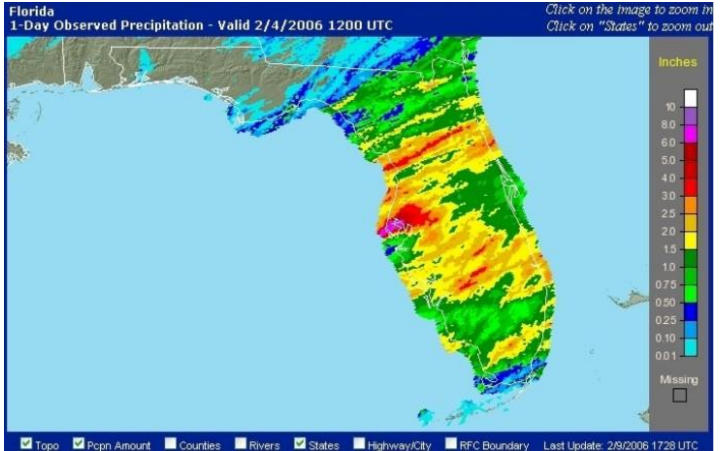
Figure 1. Precipitation Accumulation Estimate, Florida Peninsula, 7 AM EST February 3rd to 7 AM EST February 4th, 2006. (click to enlarge)