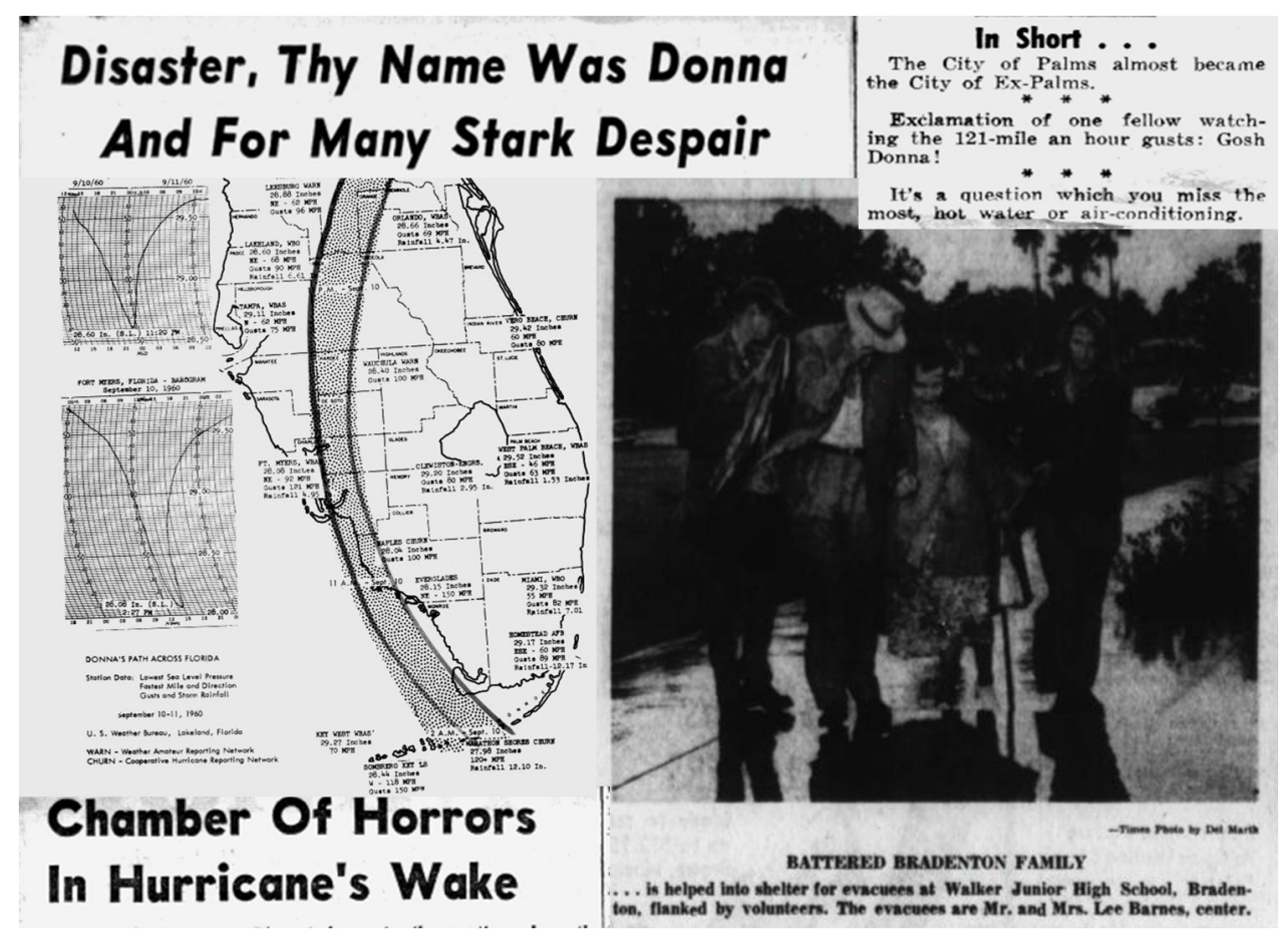
Figure 3. Headlines and pictures from the St. Petersburg Times, Fort Myers News Press, and the National Hurricane Center.