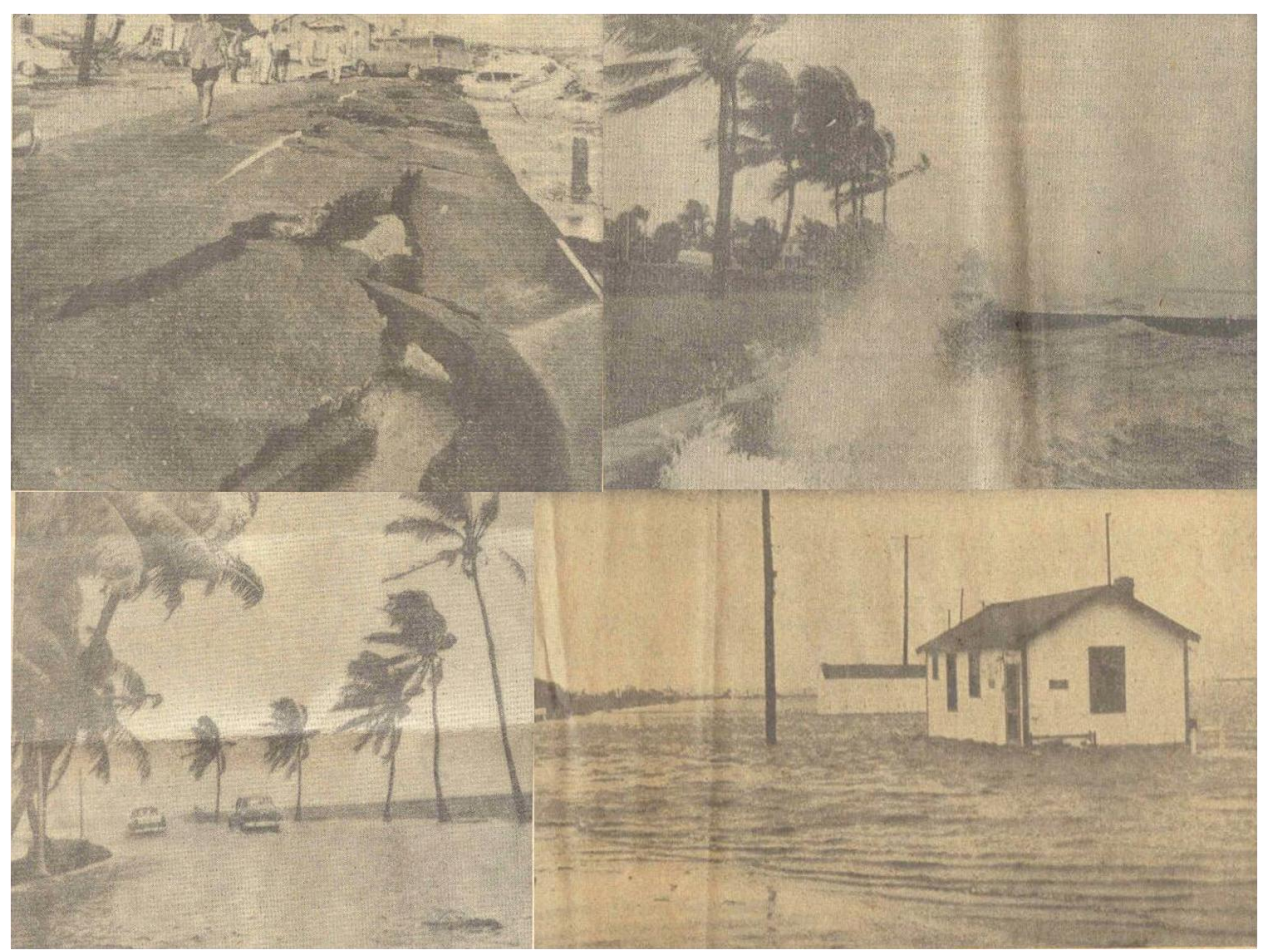
Figure 5.

Links for more information: <a href="http://www.hurricanes-blizzards-noreasters.com/hurricanedonna.html">http://www.hurricanes-blizzards-noreasters.com/hurricanedonna.html</a>, <a href="http://www.sun-sentinel.com/news/local/southflorida/sfl-1960-hurricane,0,4024486.story">http://www.sun-sentinel.com/news/local/southflorida/sfl-1960-hurricane,0,4024486.story</a>, <a href="http://www.nhc.noaa.gov/archive/storm_wallets/atlantic/atl1960/donna/">http://www.nhc.noaa.gov/archive/storm_wallets/atlantic/atl1960/donna/</a>, <a href="http://www.naonl.noaa.gov/general/lib/lib1/nhclib/mwreviews/1960.pdf">http://www.naonl.noaa.gov/general/lib/lib1/nhclib/mwreviews/1960.pdf</a>, <a href="http://www.naplesnews.com/news/2008/sep/09/remembering-donna/">http://www.naplesnews.com/news/2008/sep/09/remembering-donna/</a>.