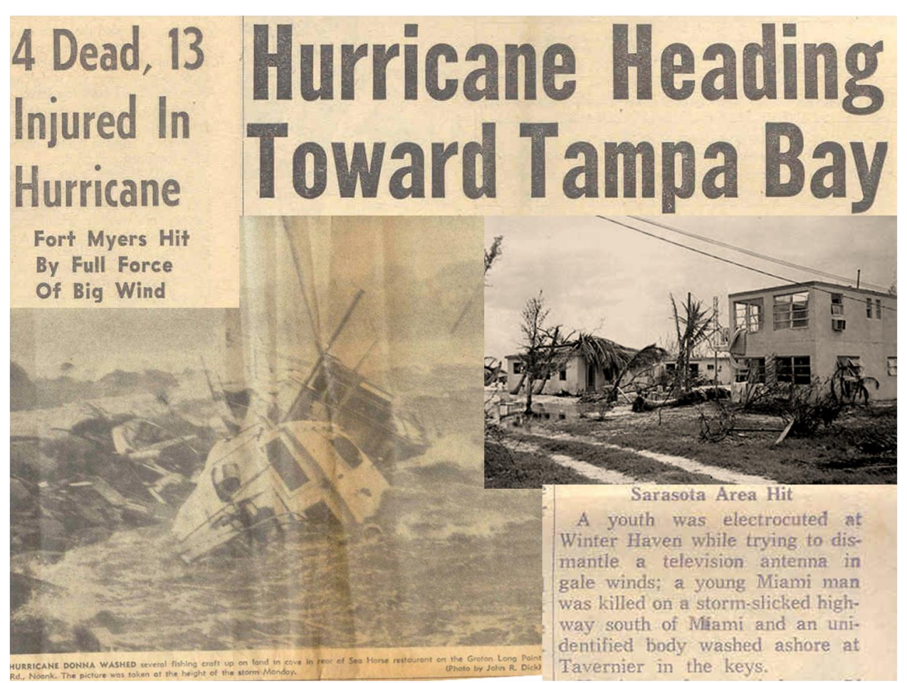
Figure 4. Headlines from www.hurricanes-blizzards-noreasters.com and www.sun-sentinel.com.