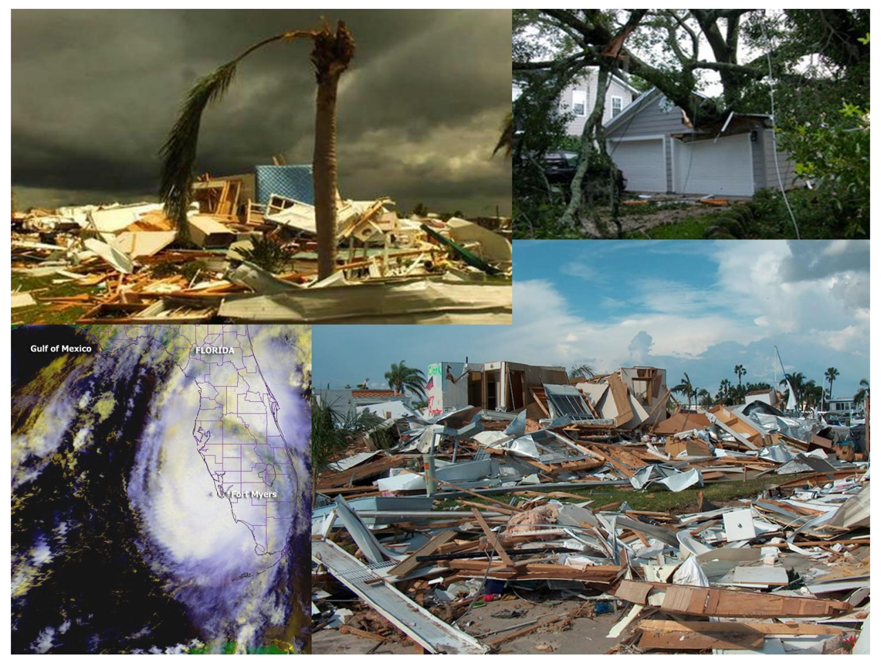
Figure 3. Damage from Hurricane Charley and satellite image of Hurricane Charley's landfall.