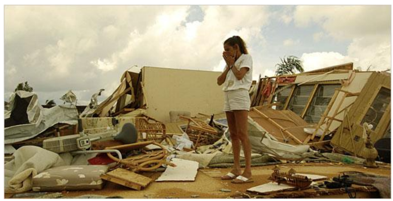
Figure 1. Woman overlooks her damaged home.

• Max storm surge: 7 ft on Sanibel Island