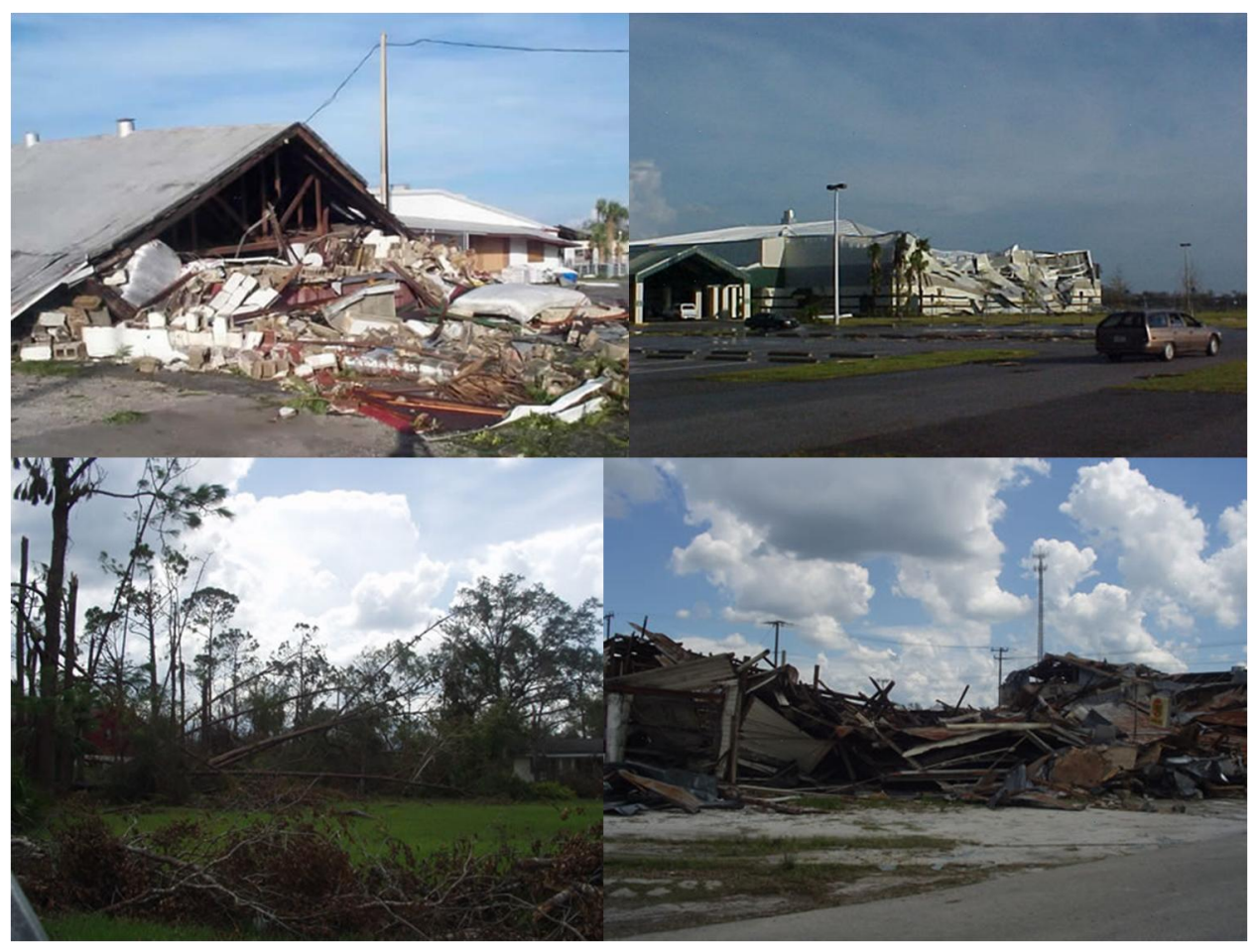
Figure 5. Damage to buildings and uprooted trees from Hurricane Charley.