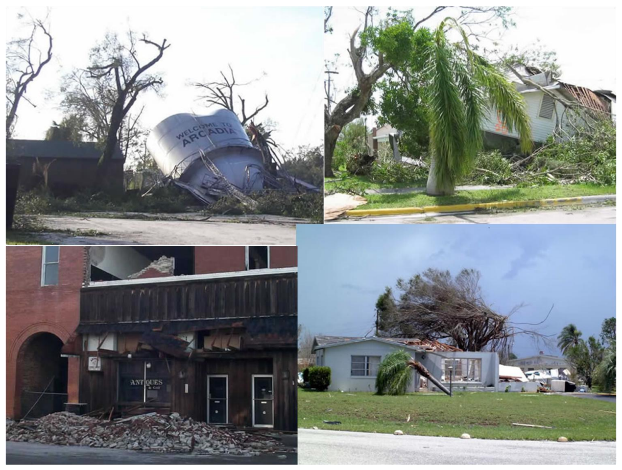
Figure 4. Damage from Hurricane Charley.