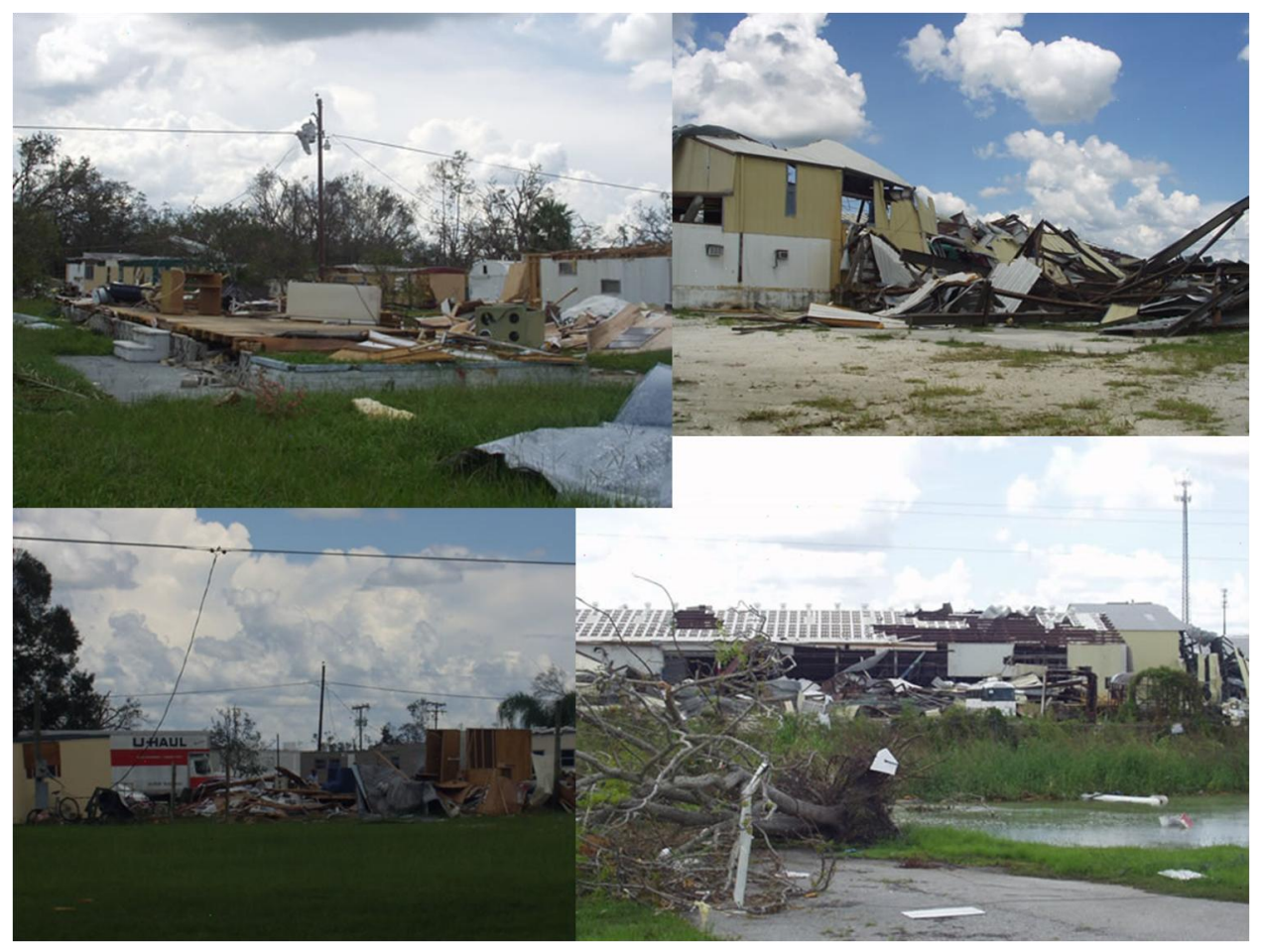
Figure 6. Damage photographs from Hurricane Charley.

Acknowledgments: The Los Angeles Times. Los Angeles, CA: Aug 15, 2004. "Aftermath of a Hurricane."