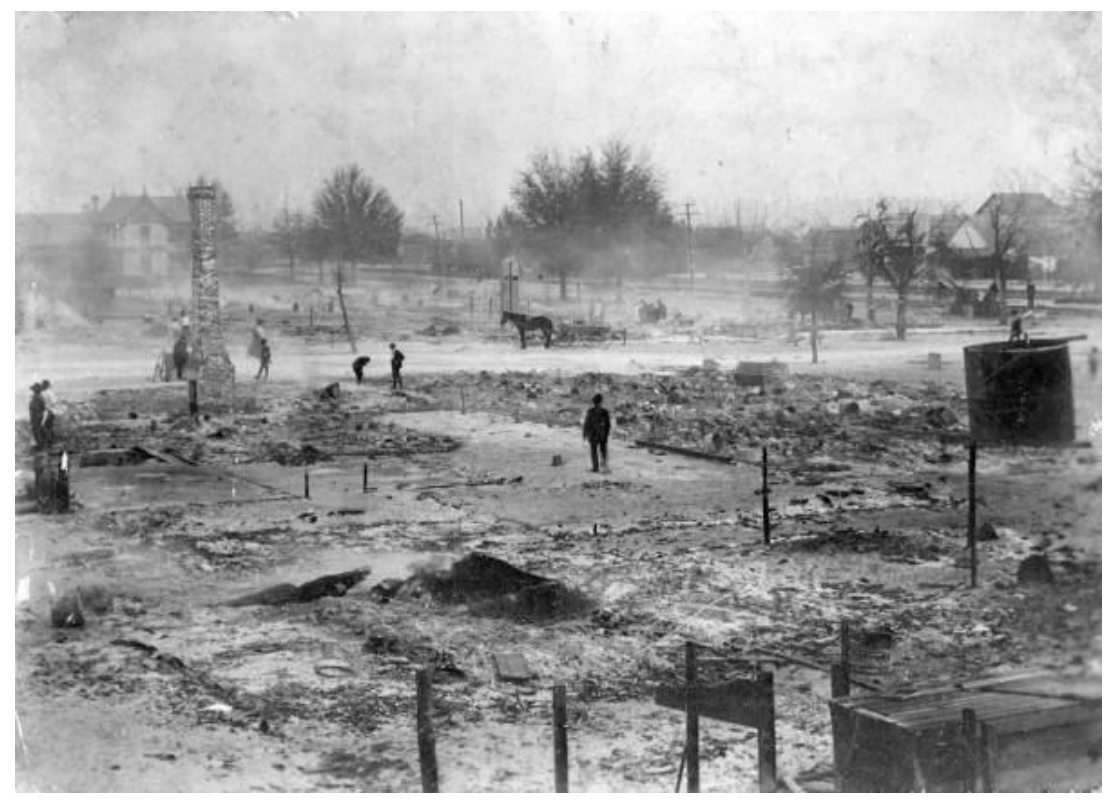
No structures were standing in this community in Apopka after a tornado sweep through it.