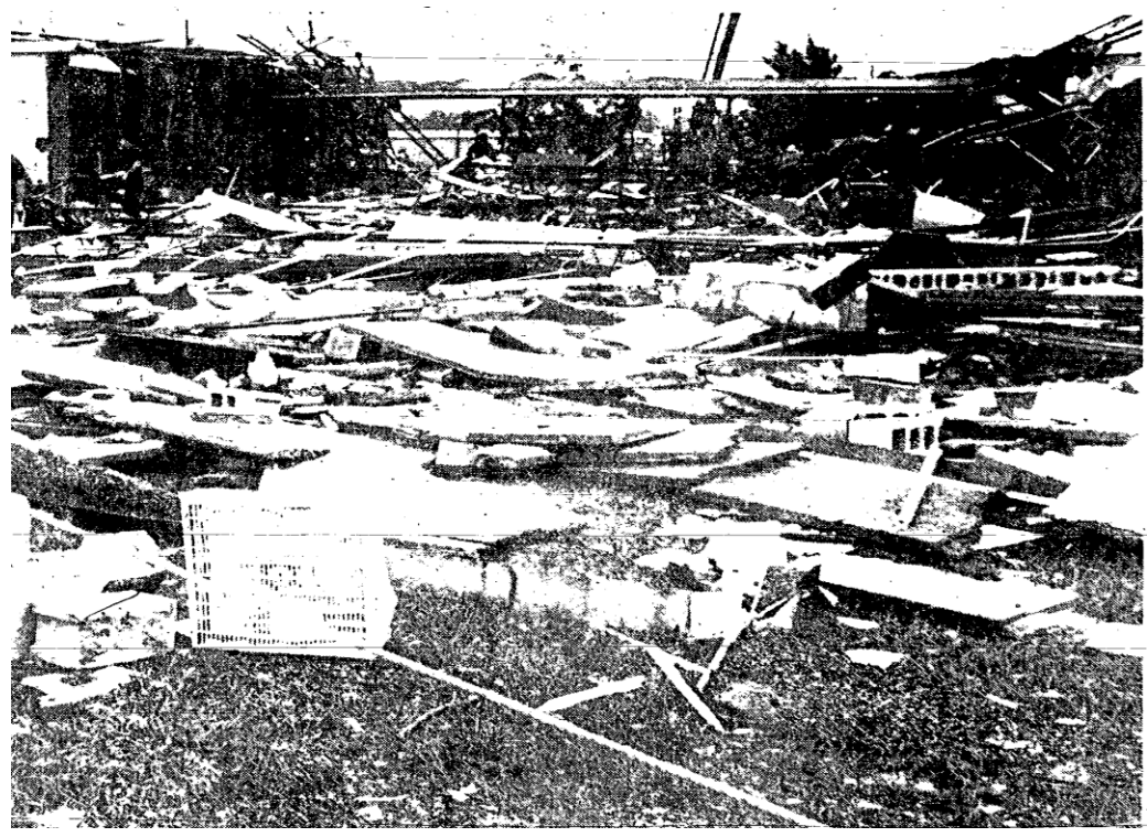
Just a splintered shell of what was High Point Elementary School remains in the wake of Thursday's tornado.